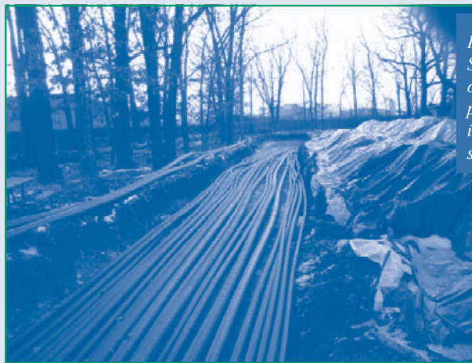
Figure 3. Nested SVE lines involving over 6,000 feet of piping were installed at the NGC site.