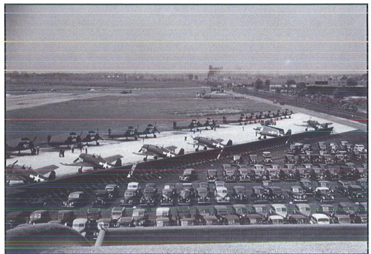
Grumman's operations during World War II looking northwest in Bethpage (1943).

Documentation of Northrop Grumman's long and close collaboration with NYSDEC, NYSDOH, the U.S. Navy, and other federal, state, and local regulatory agencies to address environmental conditions in the area are available for review at the Bethpage Public Library, 47 Powell Avenue, Bethpage, NY 11714.