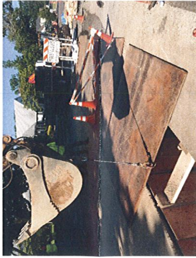
Road plates cover trenches

Each of our two work crews will use backhoes, dump trucks, and other machinery to excavate the trench and install the pipe. First, the uppermost surface of the street will be removed. Then, the pipe trench will be excavated in sections (approximately 150 feet in length). Road plates will be installed daily over open excavations until they can be backfilled and also to allow homeowners access to their driveways. After the pipe is installed in the bottom of the trench, the trench will be backfilled with clean fill and the backfill compacted.