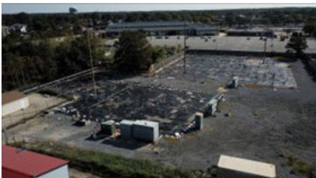
Image Showing Phase I Thermal Remediation at Bethpage Community Park. To watch a video of progress and work underway at the Bethpage Community Park, go to: https://youtu.be/ta_gBrv22Qs