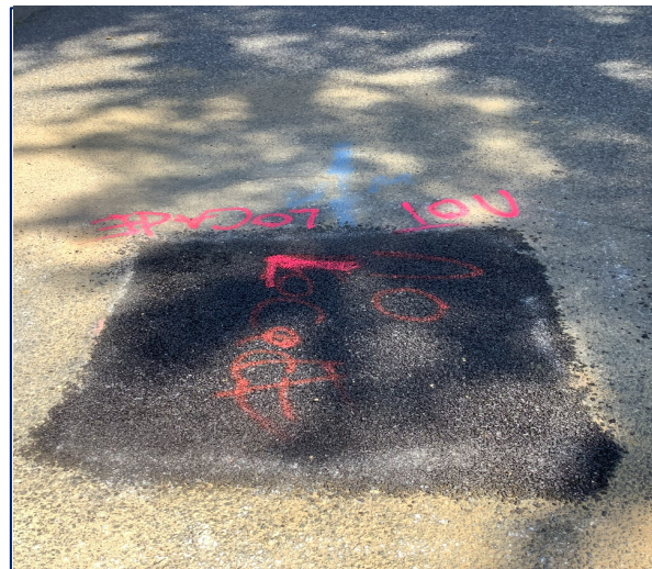
Restoration of Water Main Test Pit Near Sta. 29+75