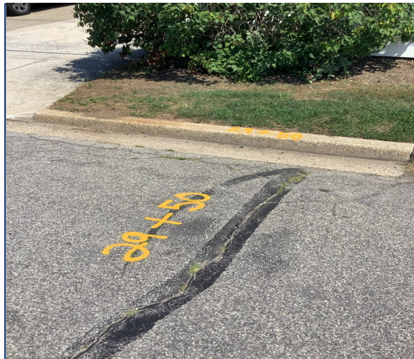
Pipeline Marking on Road Pavement at Sta. 29+50