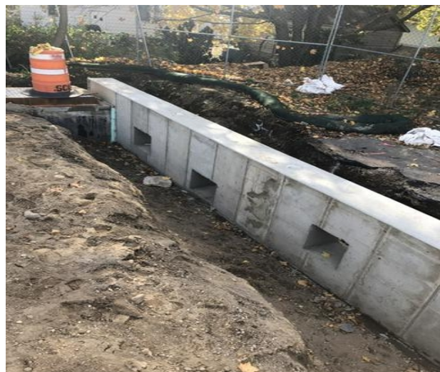
Retaining Wall on Site West Side with Future Conduit Openings