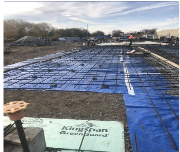
Rebar Installed in Building Northeast Corner