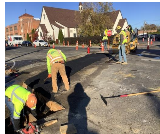
Restoring Binder Pavement on Central Ave