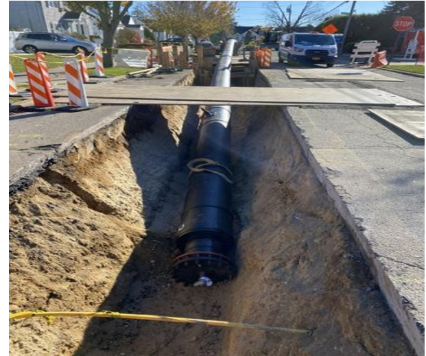
Installing HDPE Pipe on S Sheridan Ave