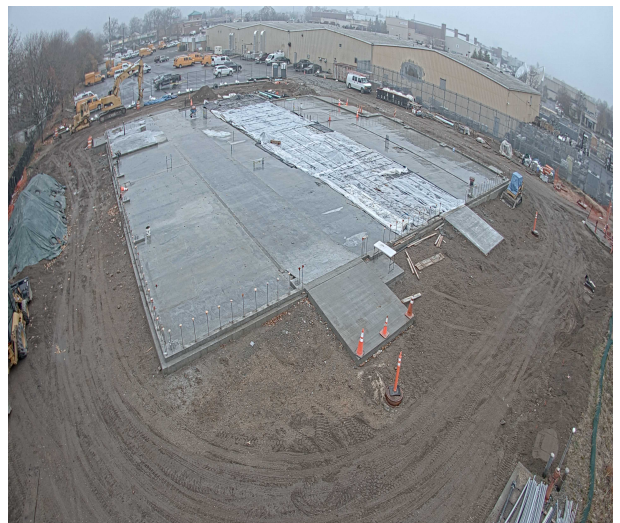
Aerial View from East Side of Site