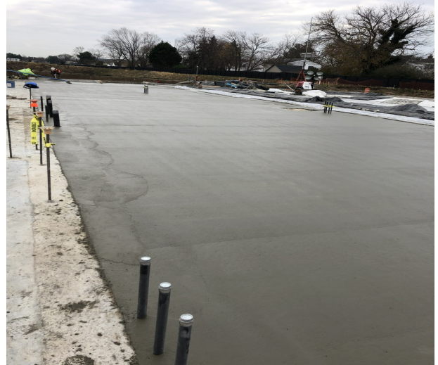
Finished Concrete Floor Slab North of Center Drain