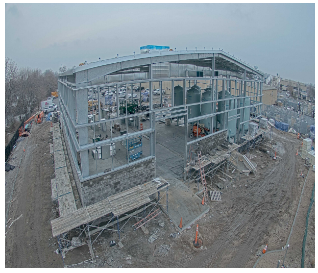
Aerial View from East Side of Site