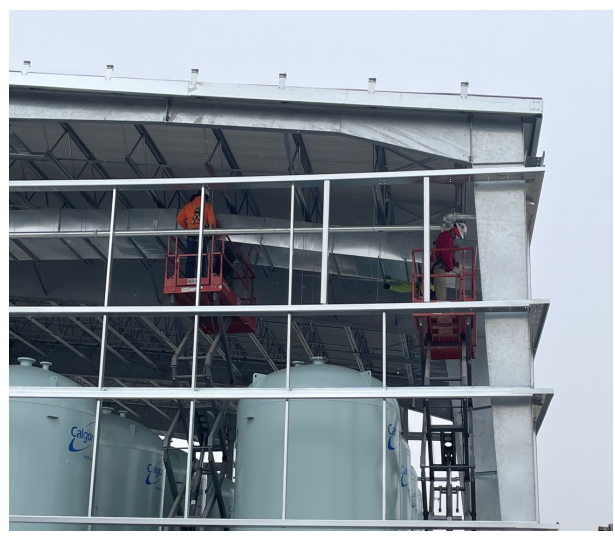
Installing HVAC Duct Above Carbon Units