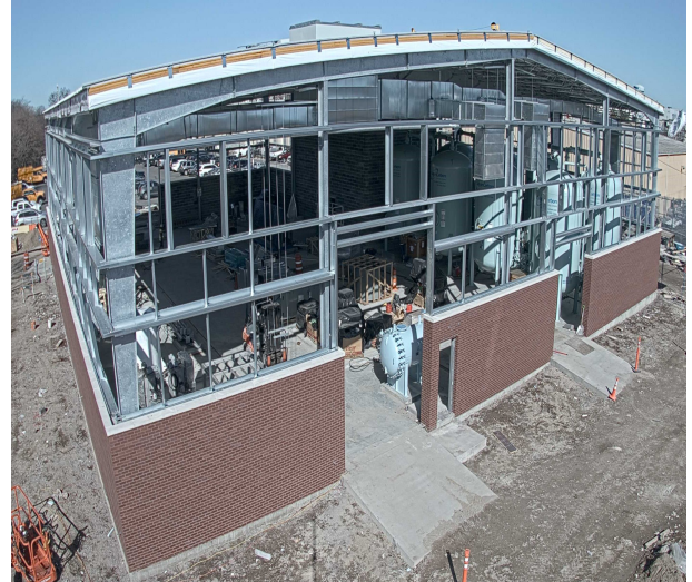
Aerial View from East Side of Site