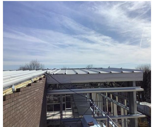
Building Metal Roof Installation