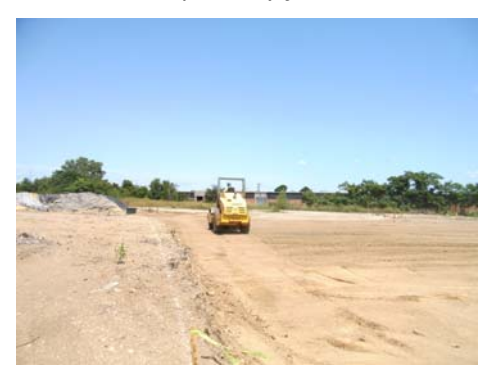
Compacting Scraped Soils Area