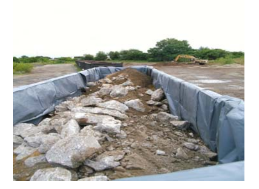
View inside partially filled railcar