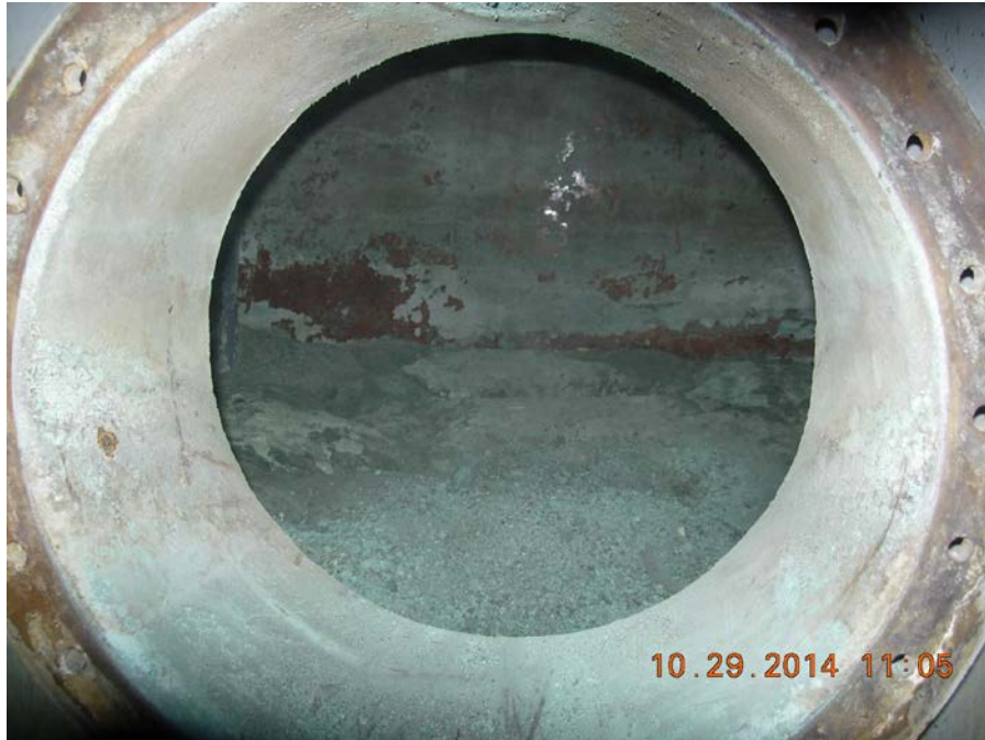
Solid material in tank