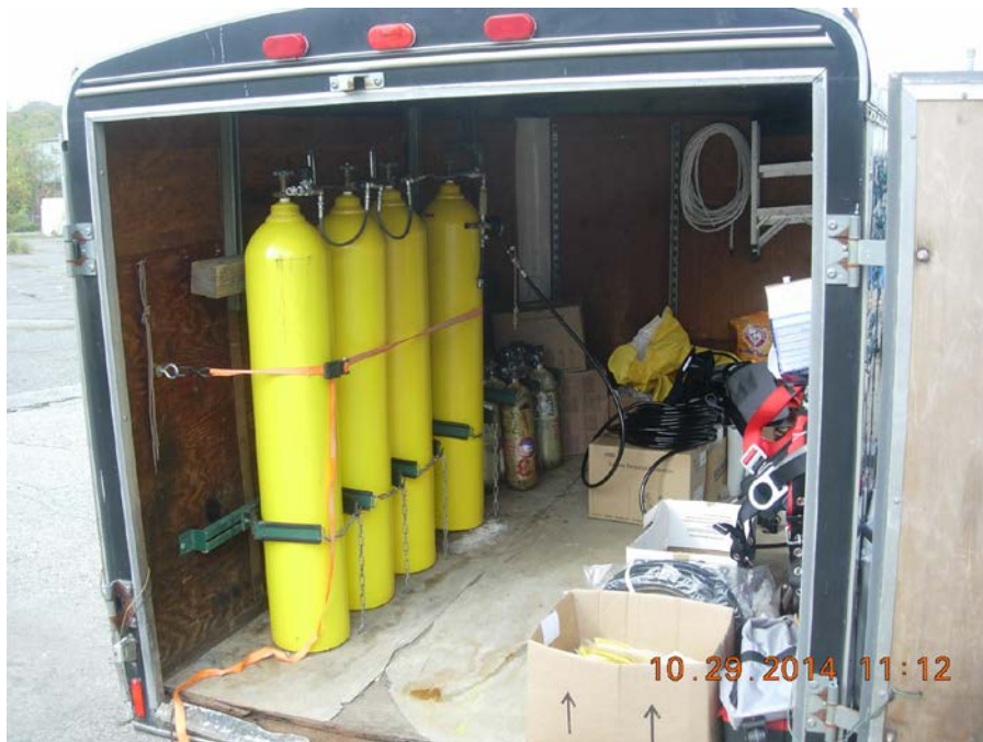
Tanks for supplied air