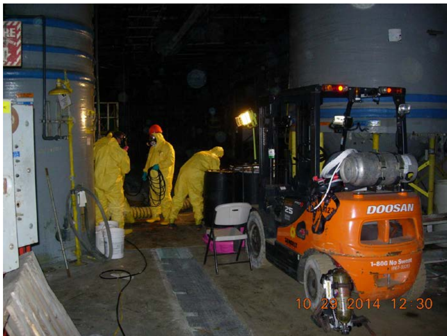
Transferring solid material to poly drum