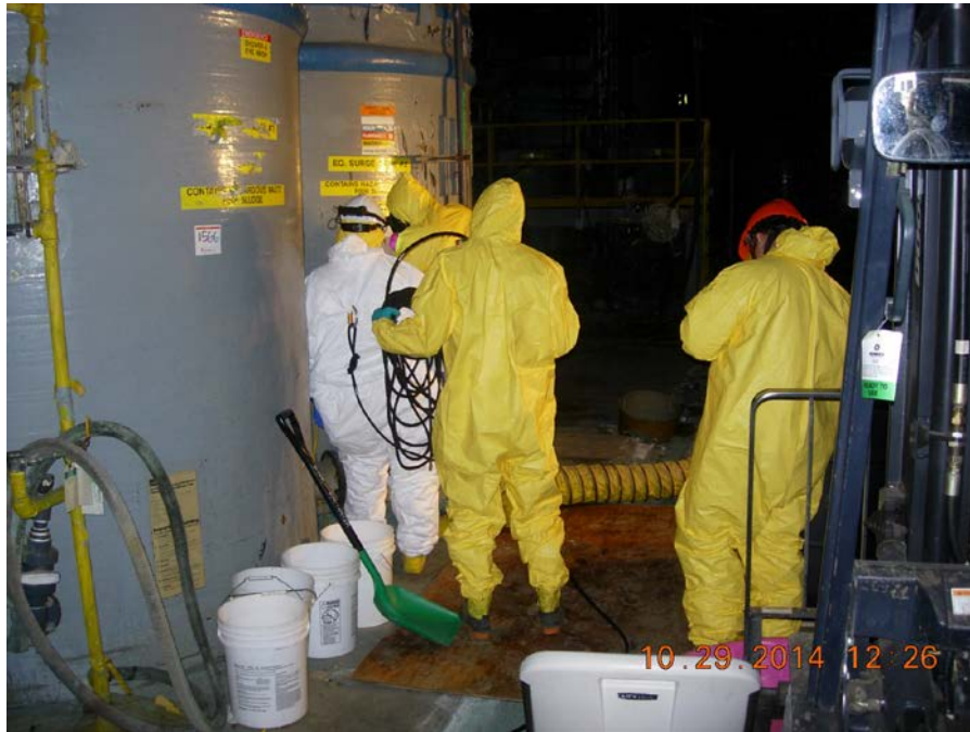
Preparing to enter 5700 gal. tank