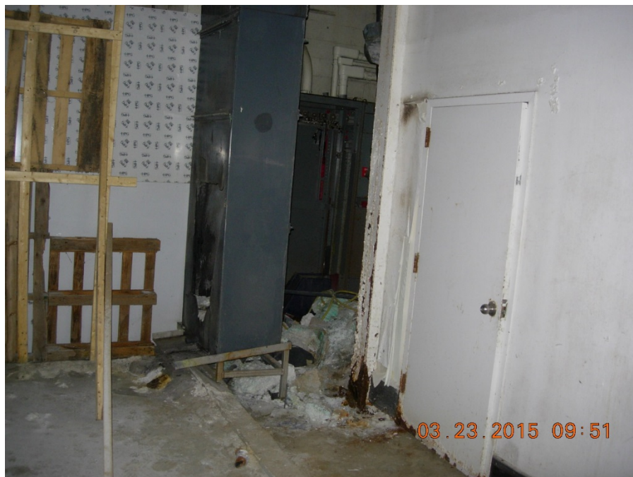
Building 7. Unknown substance on floor