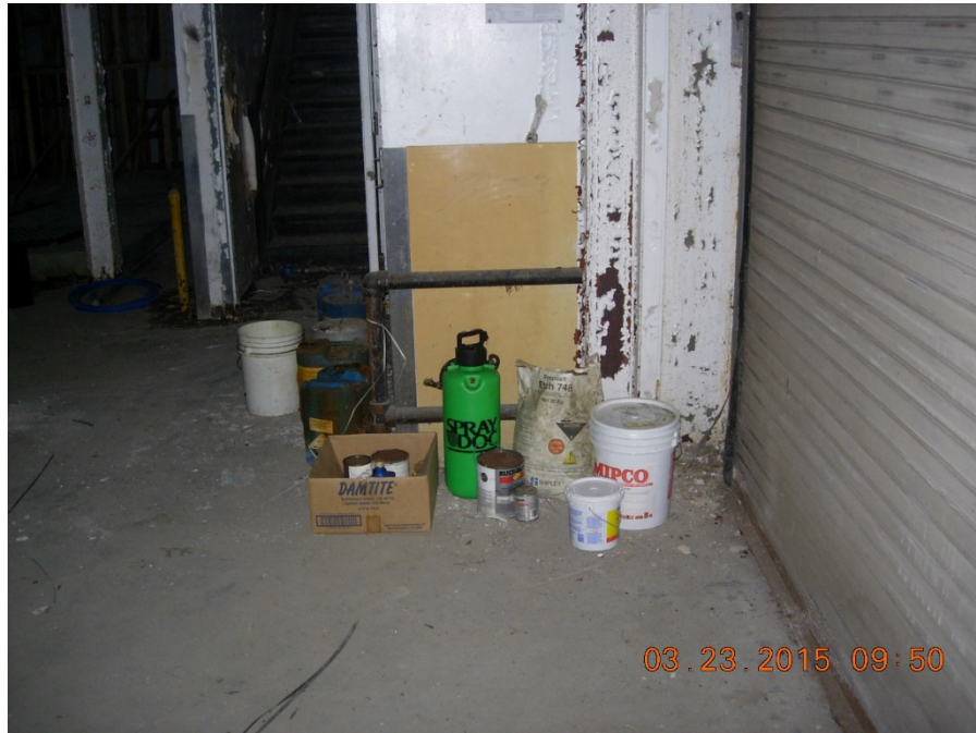
Waste chemicals staged at west end of Building 7