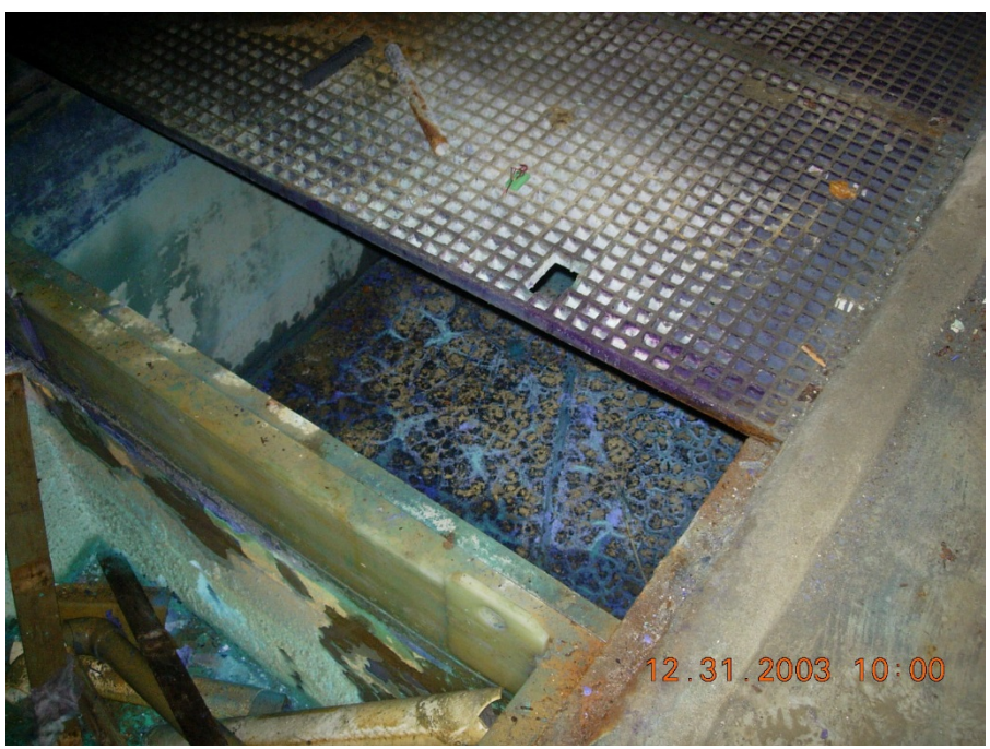
Sludge at bottom of sump