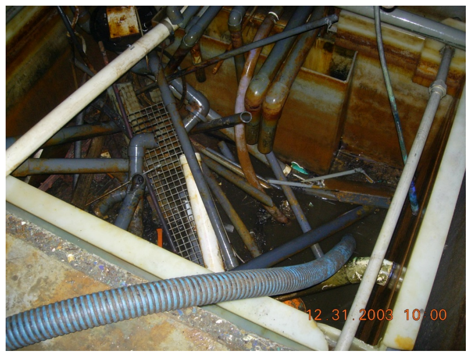
Removing water from sump