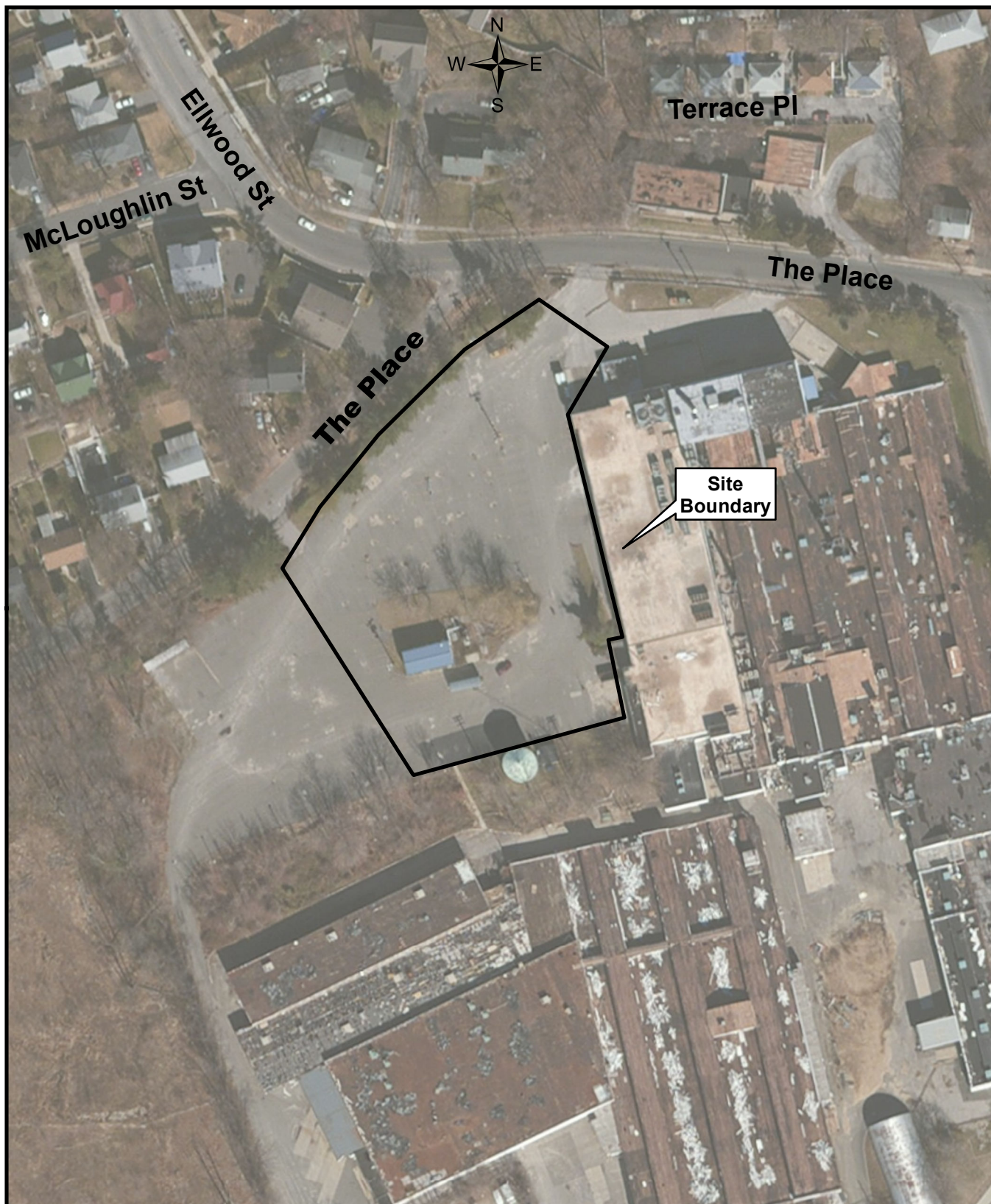
Figure 2 Site Map

Powers Chemco City of Glen Cove, Nassau County Site No. 130028