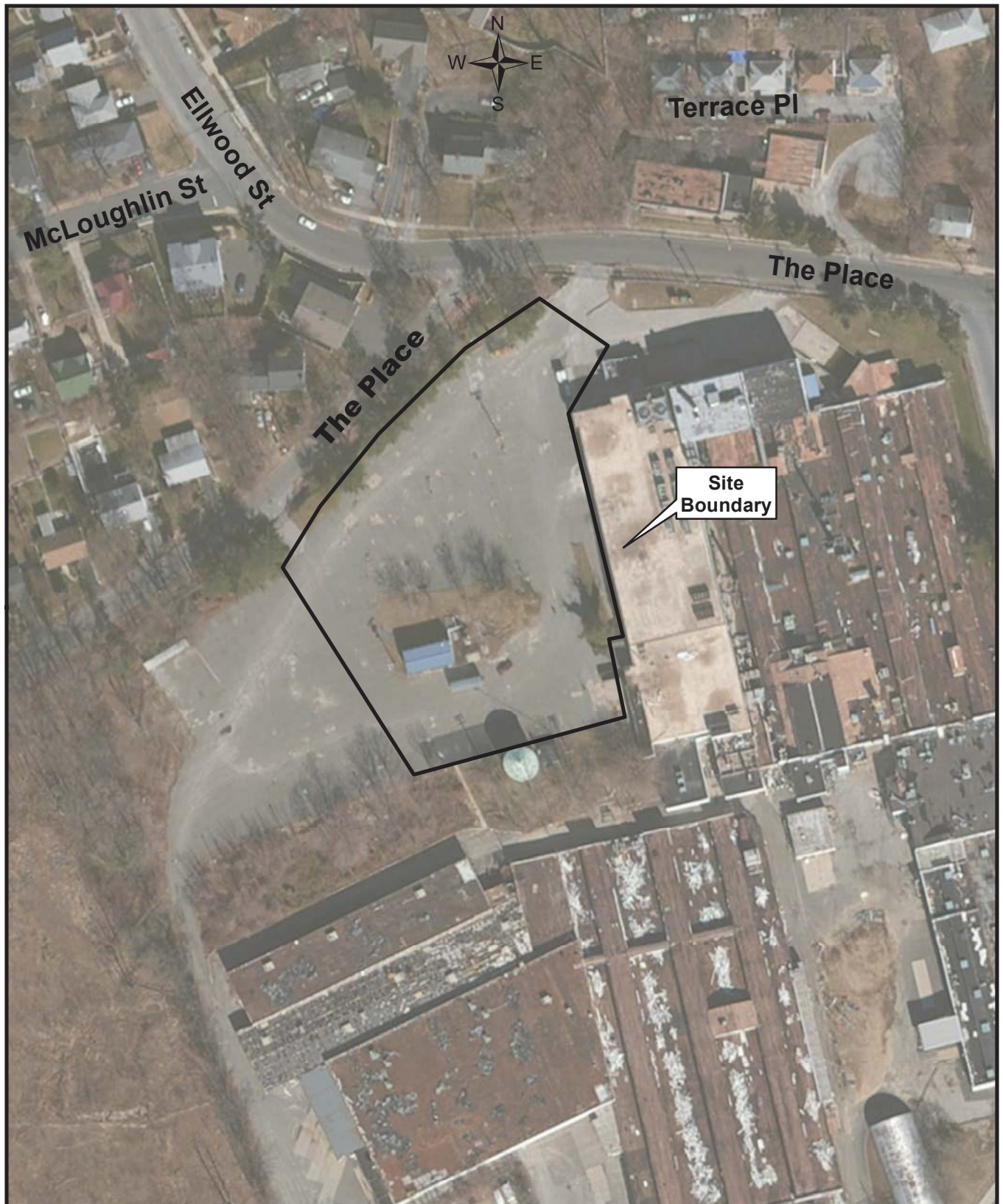
Figure 2 Site Map

Powers Chemco City of Glen Cove, Nassau County Site No. 130028