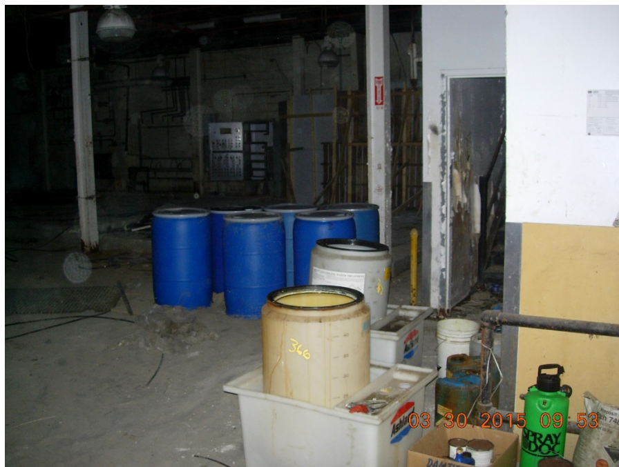
Waste chemicals staged at west end of Building 7