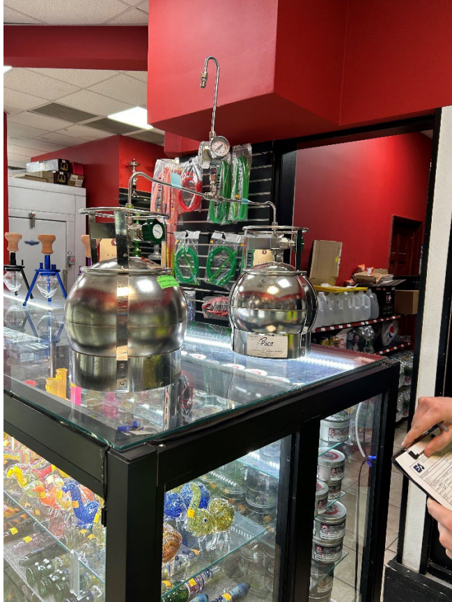
130058-IA1-0326 and 130058-DUP-0326