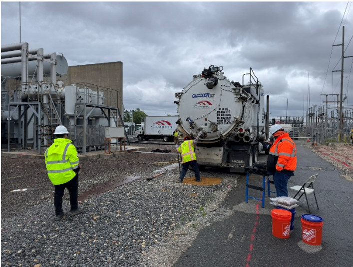
Photo 3: View of the borehole backfilled using the material excavated