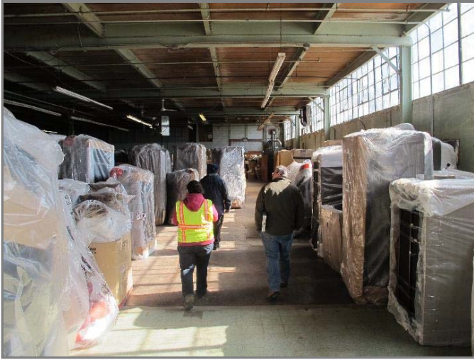
In the warehouse