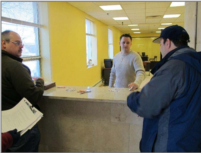
At the end of the day we went next door to Marble.com to request permission to sample indoor air.