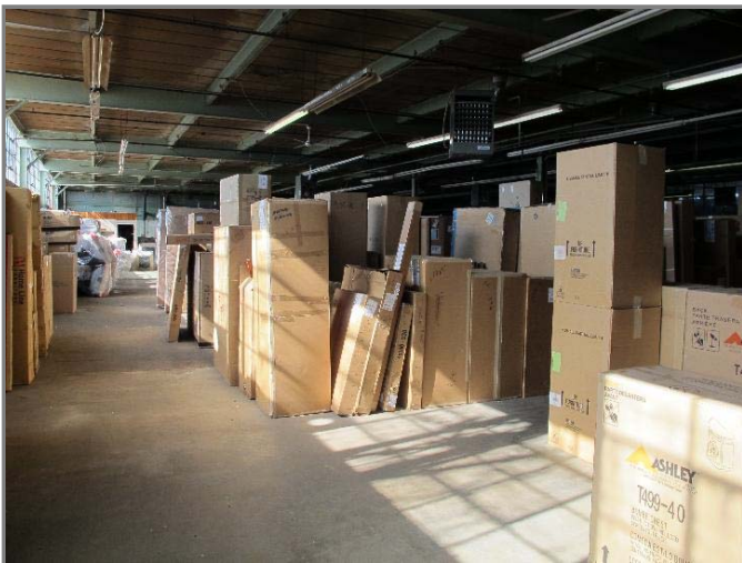
In the warehouse