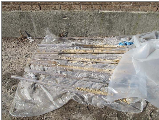
When Payson and I arrived onsite at 10:15 AM, we were greeted by owner Larry Shusheim. Drilling at the southwest corner of the SMS Instruments building was happening already. This shot is of the drill cuttings.