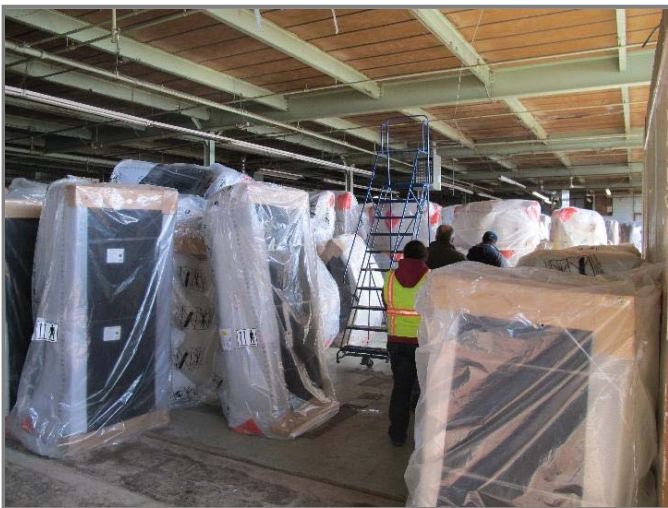
In the warehouse