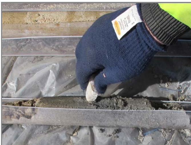
This particular drilling zone where the driller is jesturing smelled of "BTEX" in Payson's words. I noted the smell to be organic but to me it didn't smell like petroleum. Our bio-treatment has been going on for some time and probably the odor has changed as the compounds have broken down.