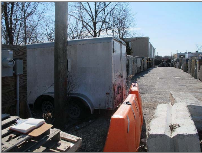
View towards the west along the back row of Marble.com.