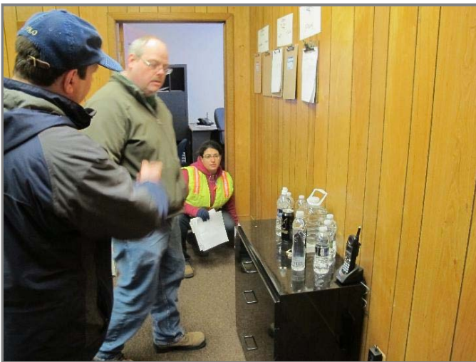
Still looking for sampling locations