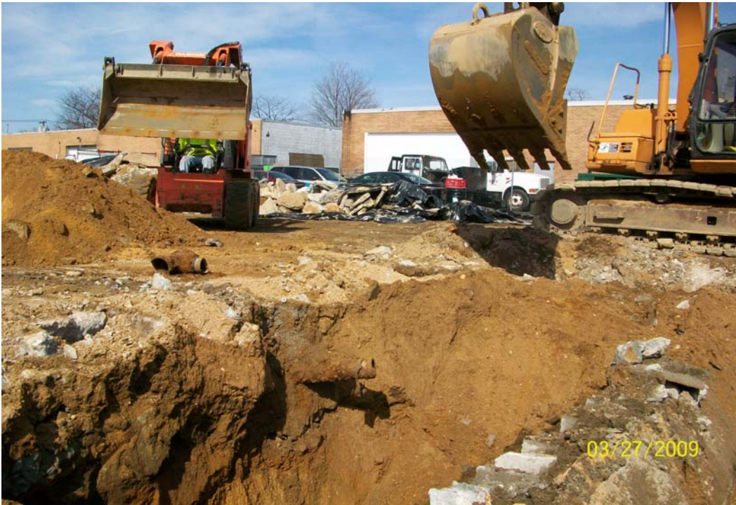
100_00233.jpg - Cast iron sewer pipe found to the west of sump-1, heading SW