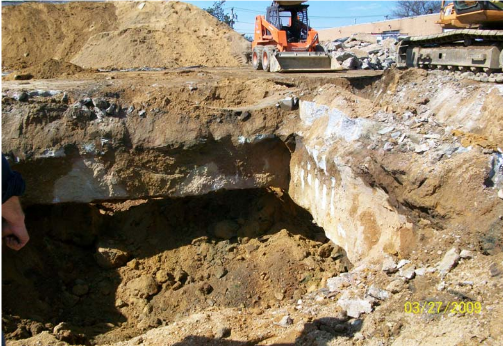
100_00236.jpg - Undermined foundation wall, NW corner of sump-1.