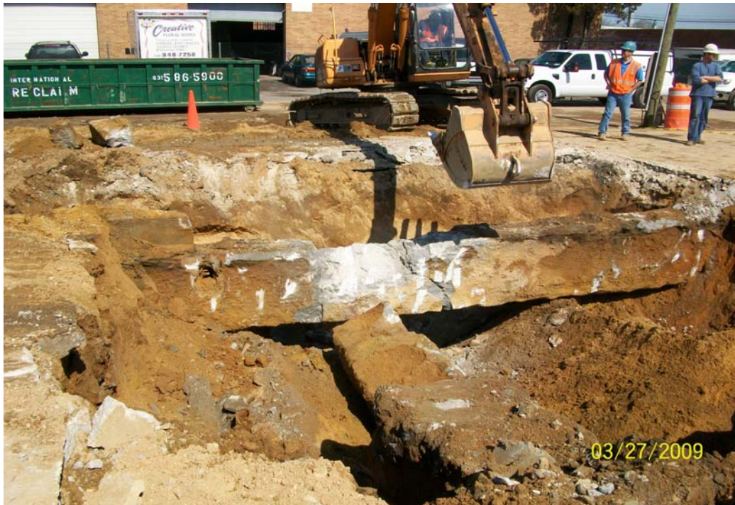
100_00238.jpg - Foundation wall partially demolished.