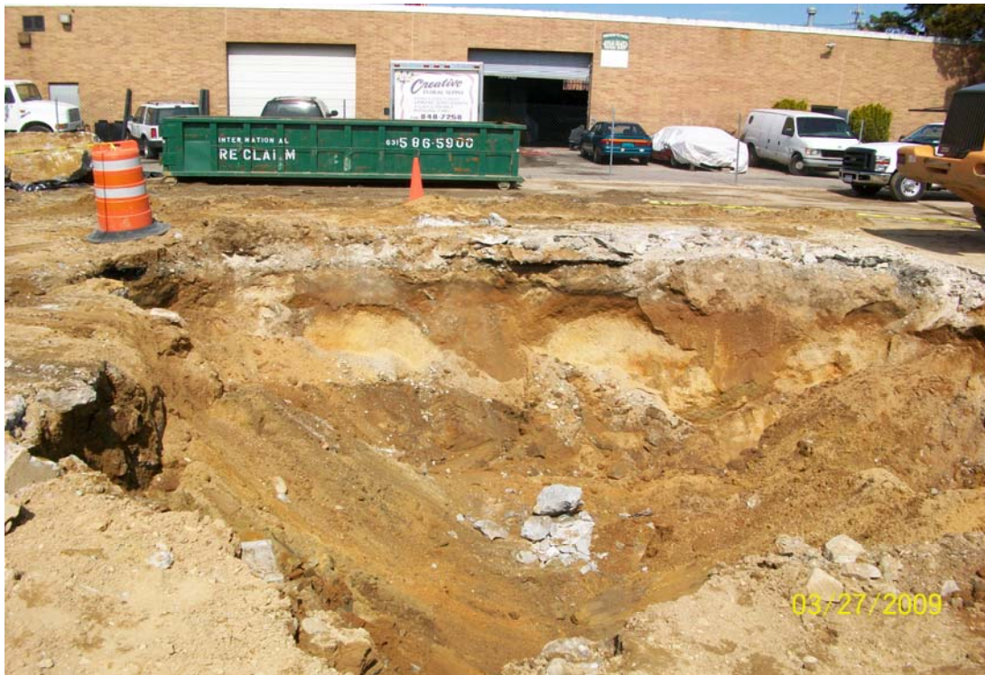
100_00241.jpg - Excavation at the end of the day, looking north.