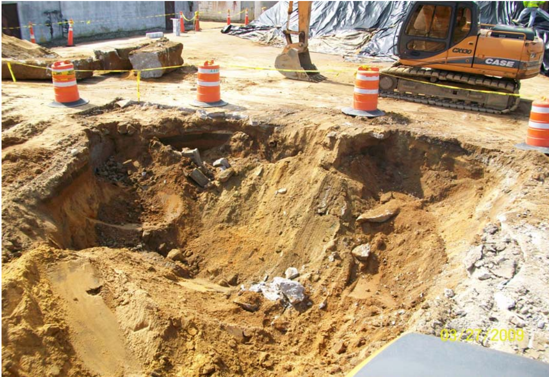
100_00243.jpg - Excavation at the end of the day, overhead view looking SW