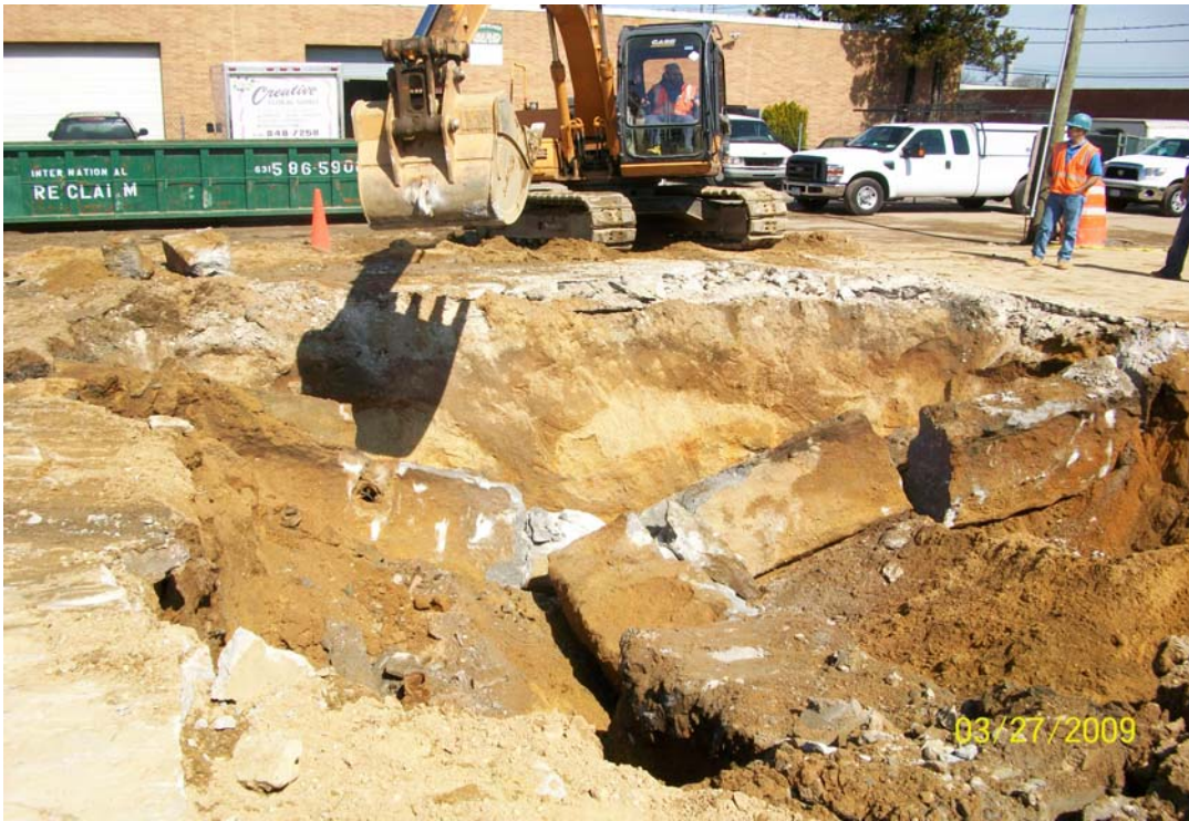
100_00239.jpg - Foundation wall completely demolished.