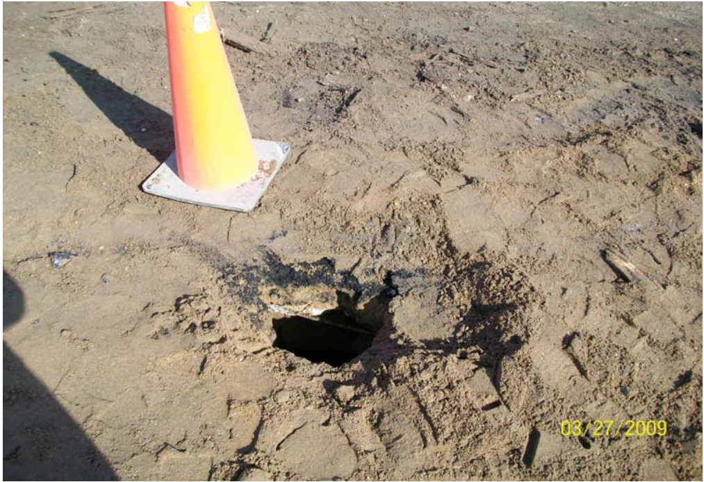
100_00229.jpg - Sinkhole on top of CP-8