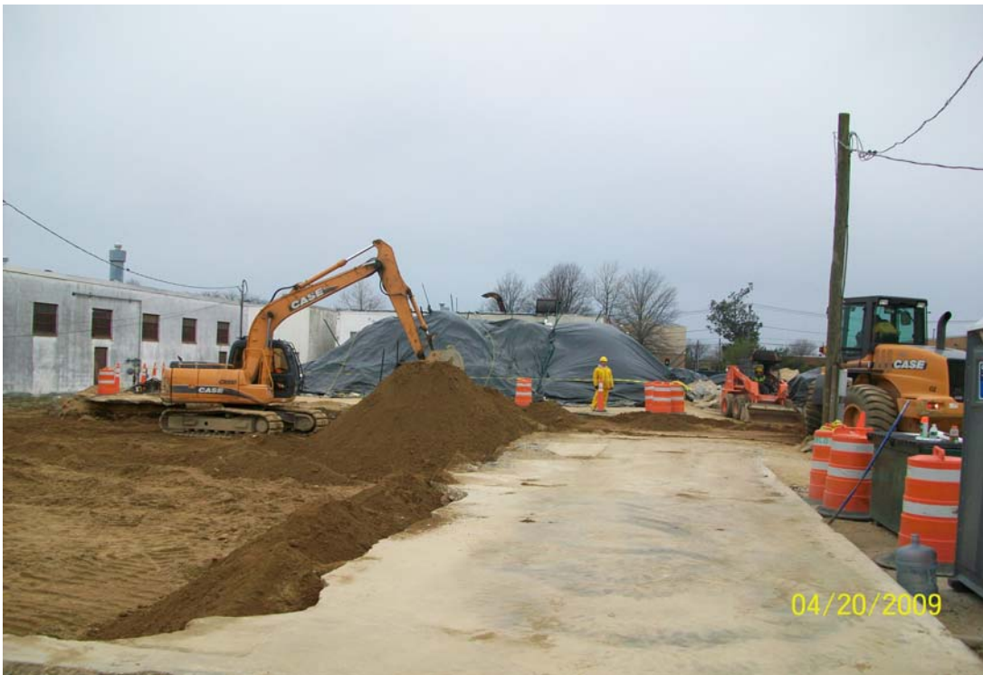
100_00438.jpg - Backfilling excavation