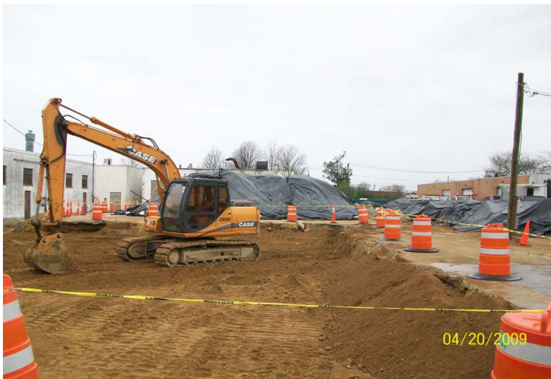
100_00440.jpg - Excavation at the end of the day, looking west