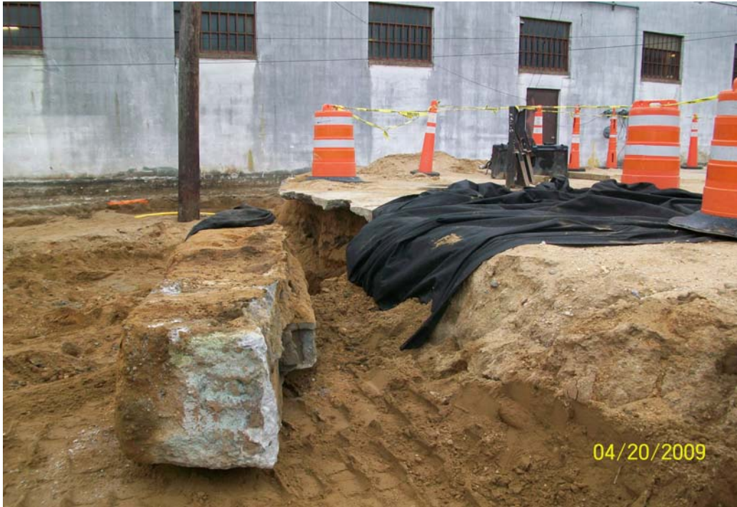
100_00437.jpg - N-S contaminated concrete foundation wall removed