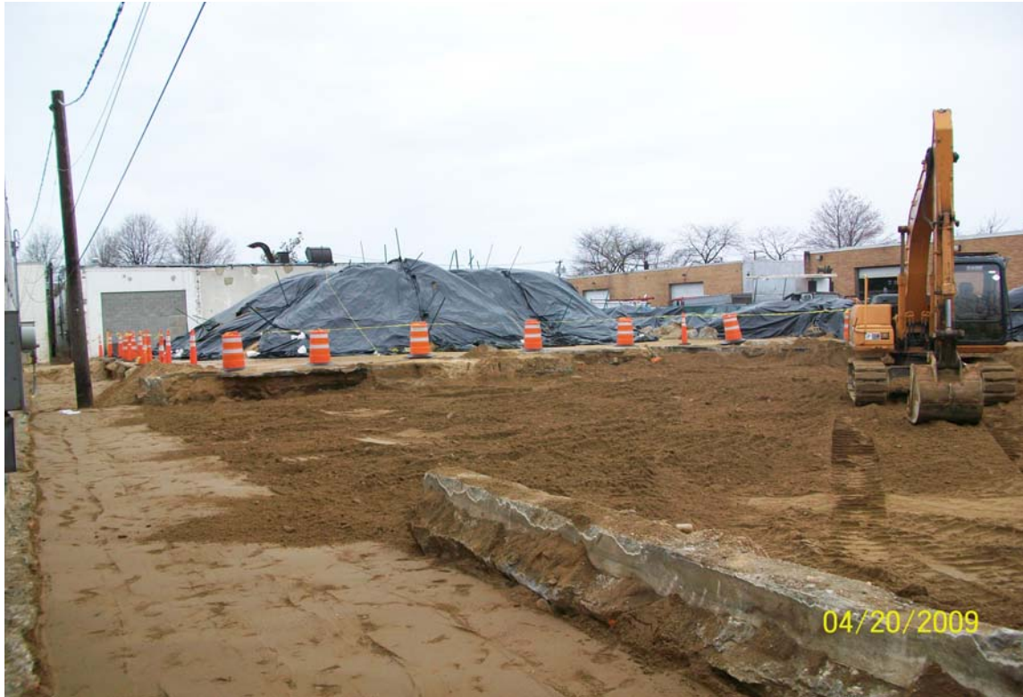
100_00439.jpg - Excavation at the end of the day, looking NW