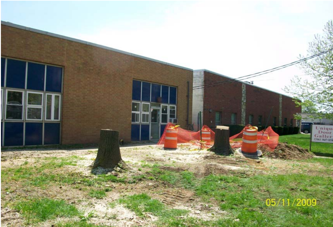
100_00588.jpg - Both trees in front of 51 Cabot St. removed.