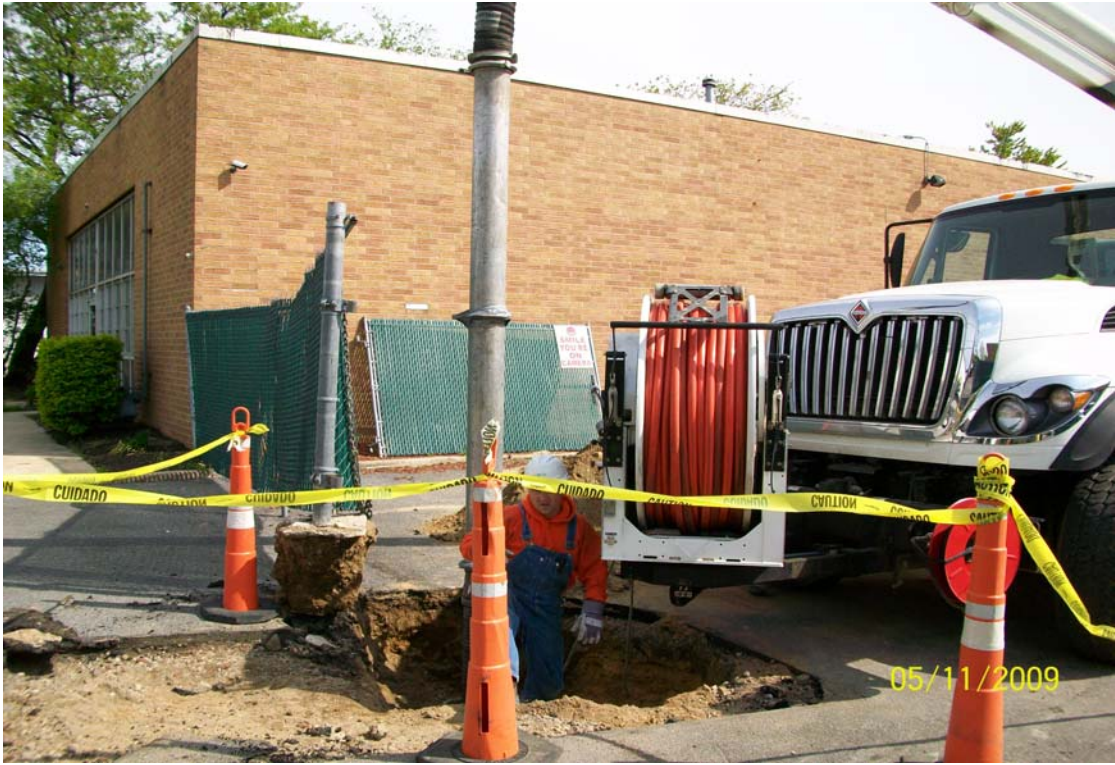
100_00586 - AARCO cleaning out CP-2.