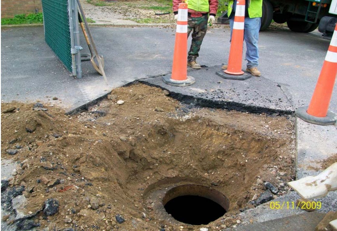
100_00583.jpg - CP-1 tank top exposed, 51 Cabot St.