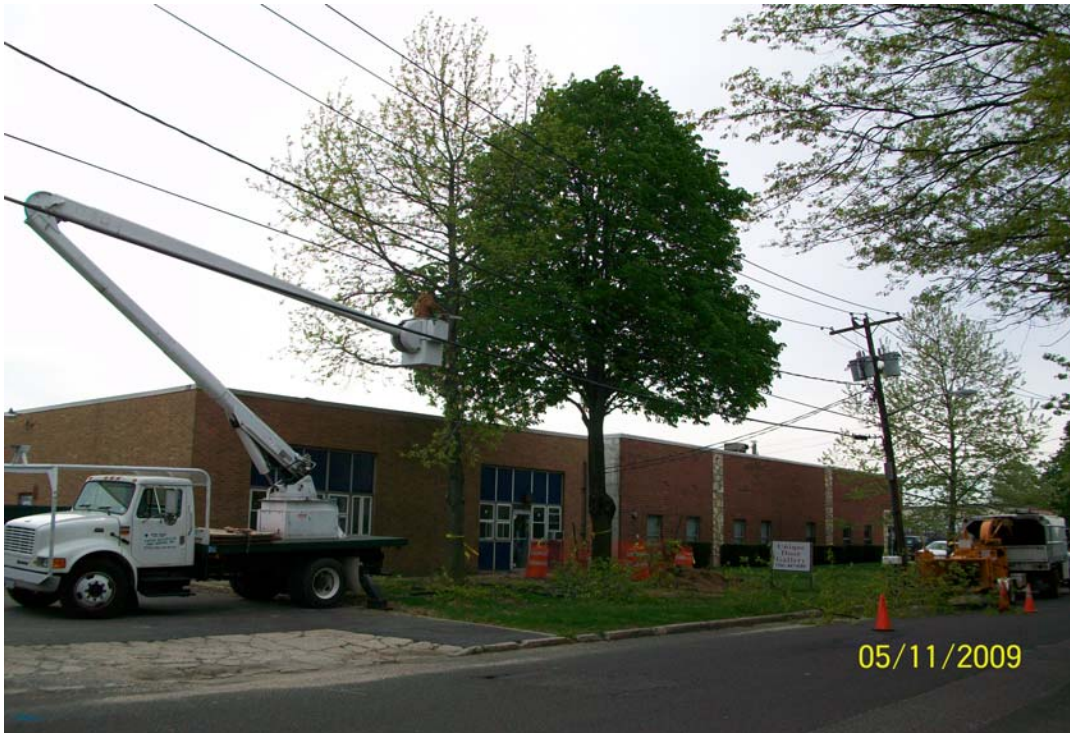
100_00582.jpg - Removing the 2 trees in front of 51 Cabot St,