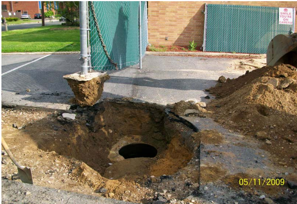
100_00580.jpg - CP-2 tank top exposed, 61 Cabot St.