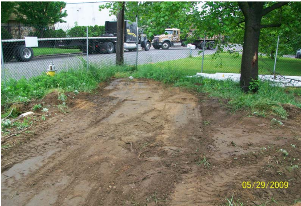
100_0727.jpg - CP-3, 50 Dale St., completely abandoned