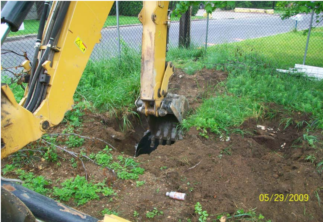
100_0726pg - CP-3, 50 Dale St., partially abandoned