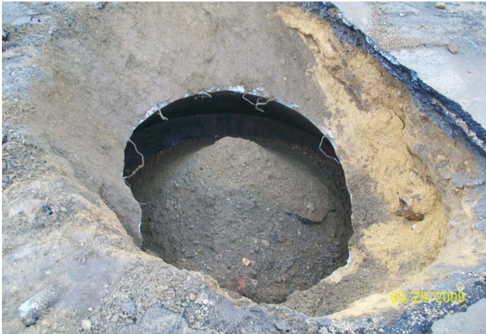
100_0725.jpg - CP-6, 51 Cabot St., partially abandoned