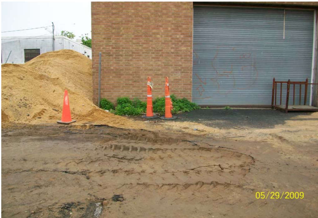
100_0727.jpg - CP-6, 51 Cabot St., completely abandoned