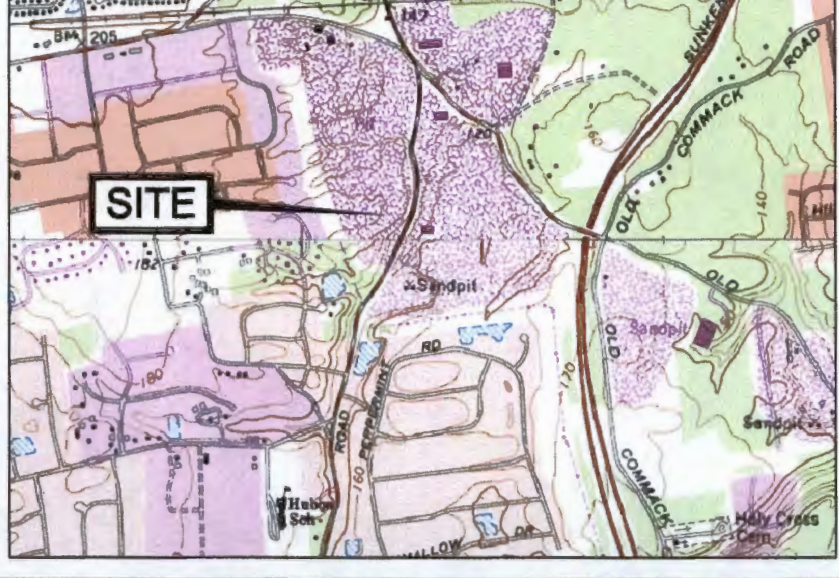
SITE LOCATOR APPROXIMATE SCALE: 1" = 2000'