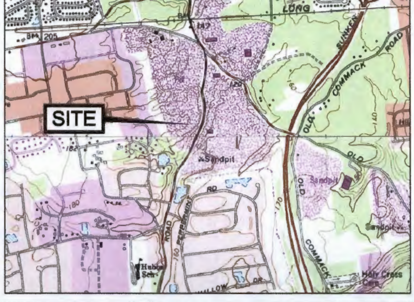
SITE LOCATOR APPROXIMATE SCALE: 1" = 2000'