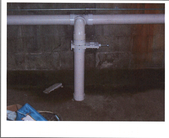
Photo #5: Extraction point and damper valve located in the addition.