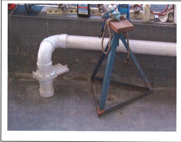
Photo #1: Extraction point and damper valve located at northwest wall.