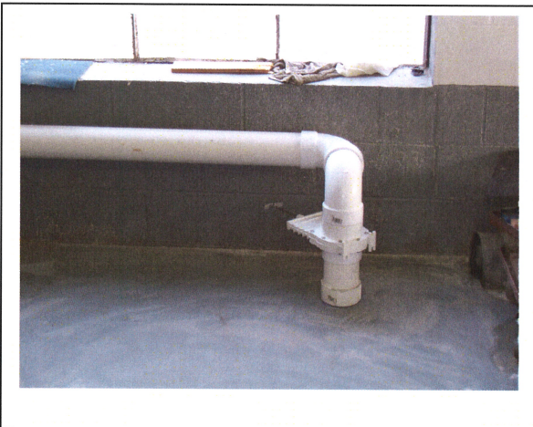
Photo #3: Extraction point and damper valve located at southeast wall.