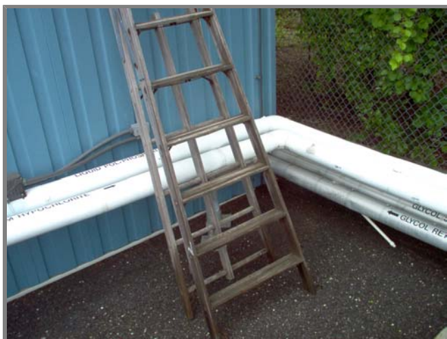
Photo left. Exterior piping.