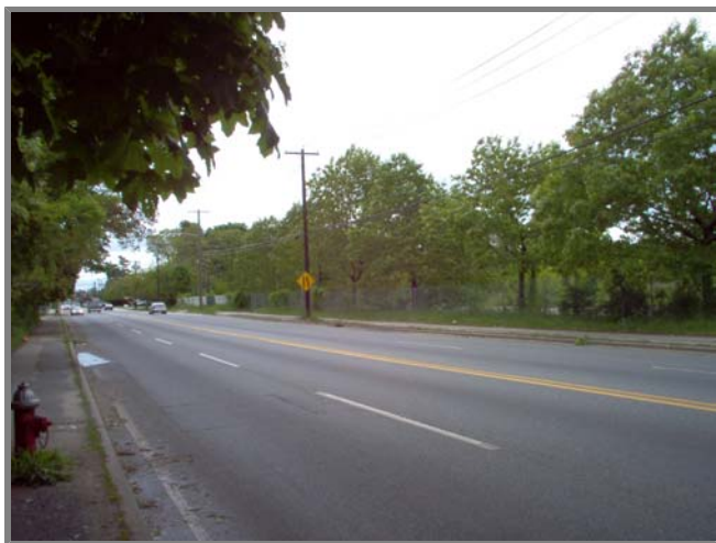
Photo left. Liberty Industrial site.