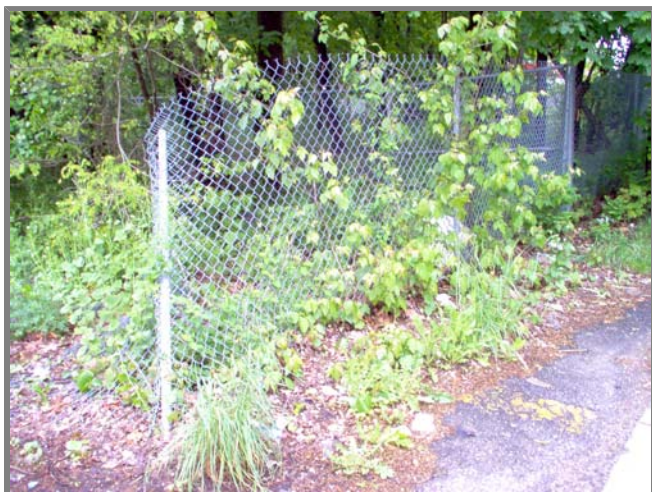
Photo left. Liberty Industrial site, broken gate.