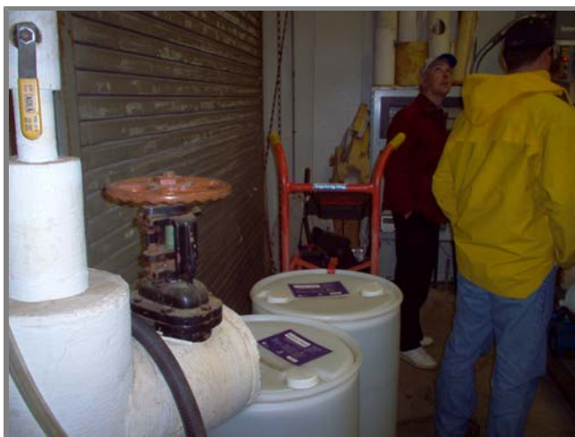
Photo left. Just inside the treatment plant.