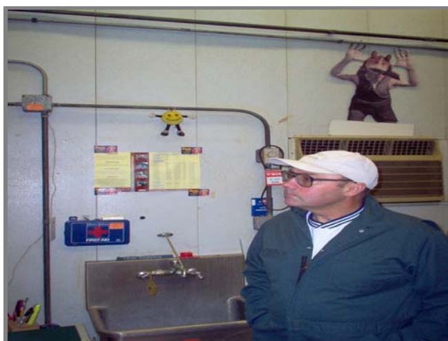
Photo left. Inside the treatment plant.