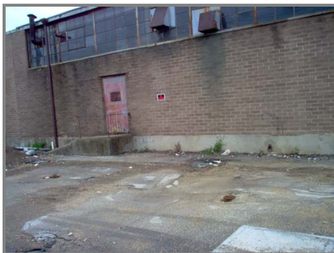
Photo left. SMS Yard