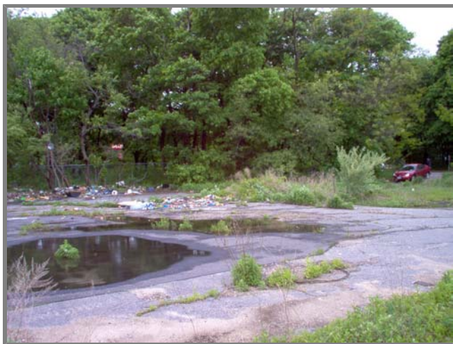
Photo left. Looking accross the pad towards the entrance way.