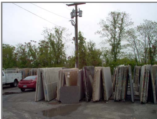
Photo left. Hundreds of slabs of decorative dimension stone is stored at the adjacent property.