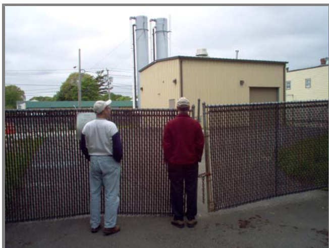
Photo left. Site 152125, Active Industrial Uniform.