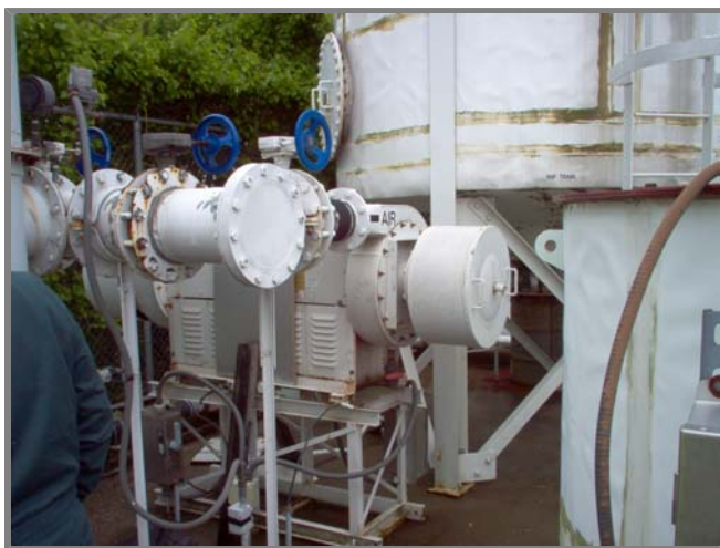
Photo left. Exterior piping.