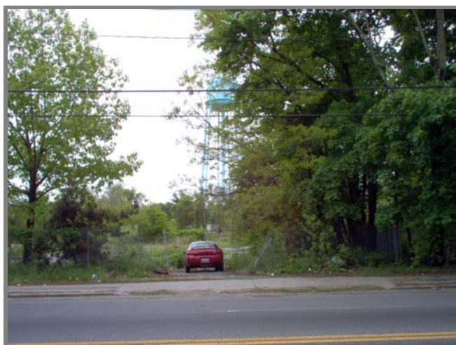
Photo left. 130005, Liberty Industrial Finishing (4 J's Co.), 55 Motor Ave., Colt Industrial Park, Farmingdale, NY 11735, Nassau County. View from accross the street.