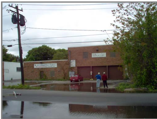
Photo left. View from accross the street.