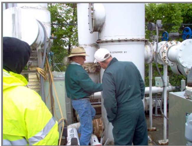
Photo left. Getting the tour.