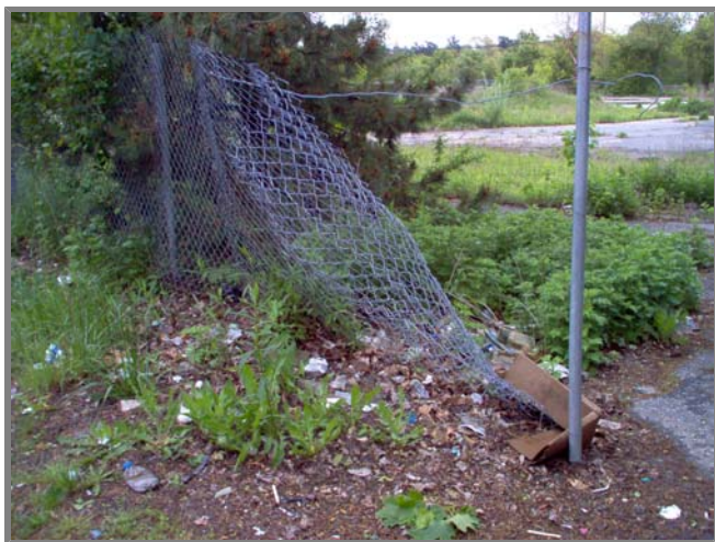
Photo left. Liberty Industrial site, broken gate.