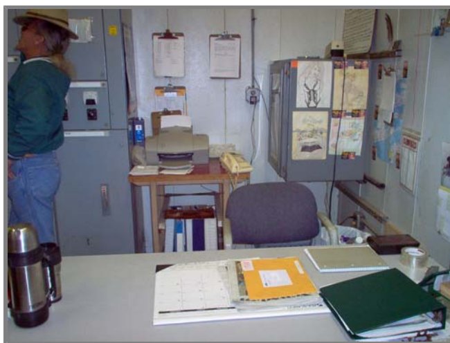
Photo left. Inside the treatment plant.