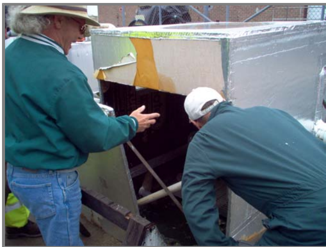
Photo left. Inside the treatment plant.