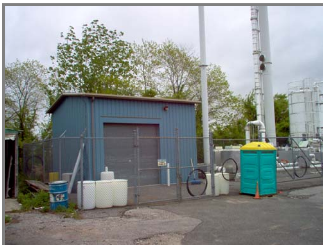
Photo left. Treatment building