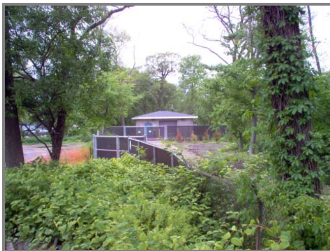
Photo left. Franklin Cleaners' treatment plant is located about a mile from the actual cleaners business location. The plant is between the Southern State Parkway and Molloy College. Franklin Cleaners' plant is "a first class operation all the way," having been designed with input from the old BHSC O&M Section.