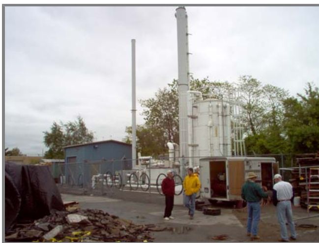
Photo left. The remedial system in the background. SMS owns the white towers and piping plus the treatment plant building. EarthTec, an EPA contractor, owns the yellow trailer.