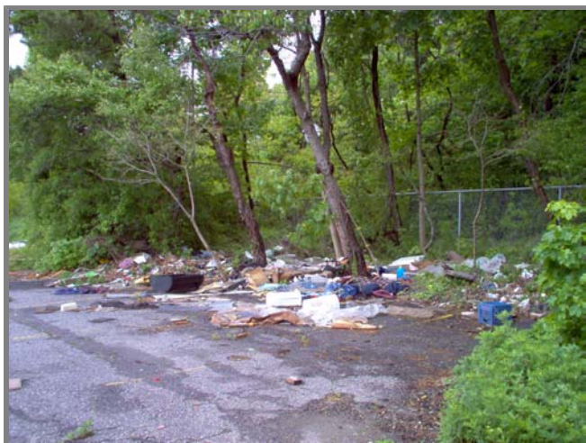
Photo left. Trash inside the open fence along the driveway.