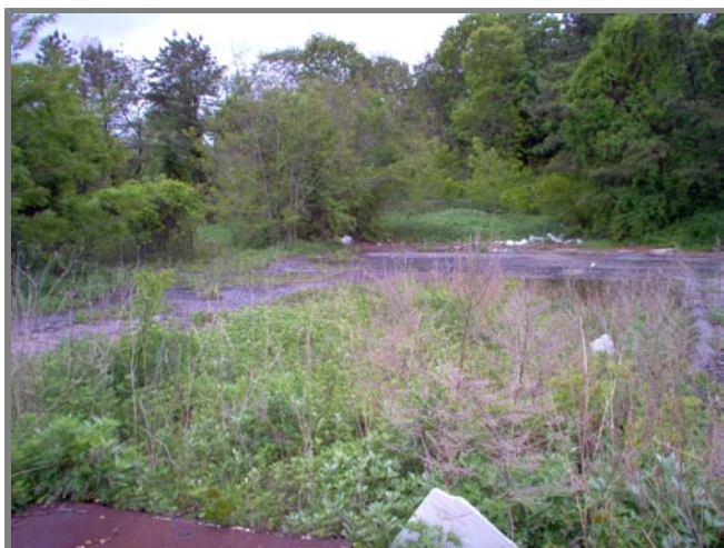
Photo left. Liberty Industrial site.