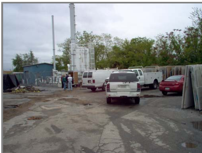
Photo left. SMS Yard