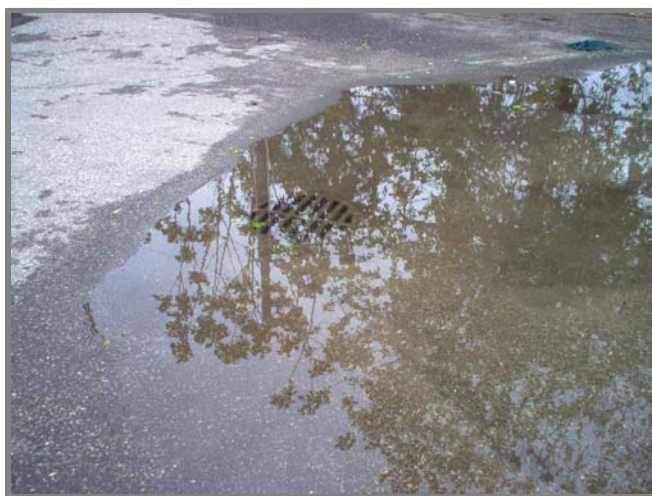
Photo left. Plugged drain in front of the plant.