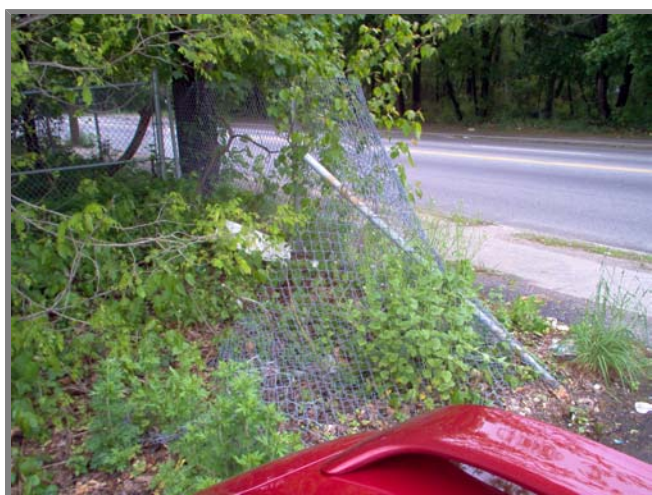
Photo left. Liberty Industrial site, broken gate.