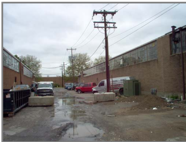
Photo left. SMS Yard