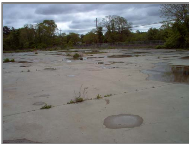
Photo left. Liberty Industrial site.