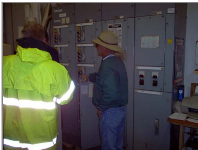
Photo left. Inside the treatment plant.