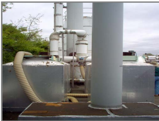
Photo left. Towers and tank. Descriptions from front to back: air discharge tower, air tower from top of air stripper to heater, air stripping tower, and water intake tank.