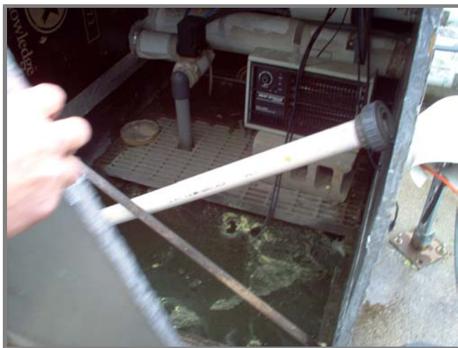
Photo left. Inside the treatment plant.