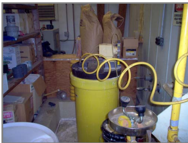
Photo left. Inside the treatment plant.