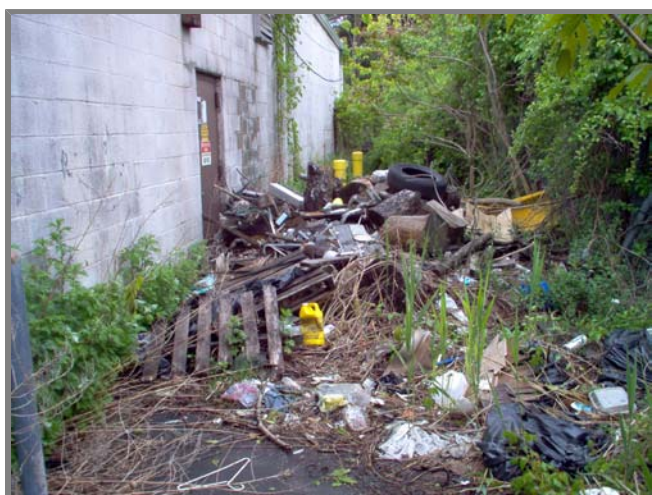
Photo left. ServAll's locked side doorway.