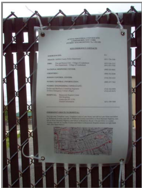
Photo left. Active Industrial Uniform