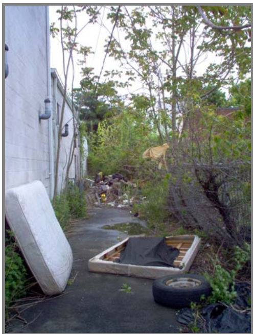
Photo left. Alley alongside of the door. More trash.