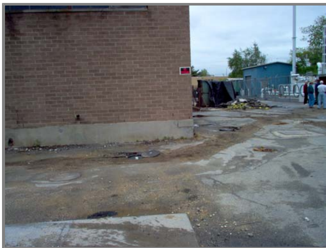
Photo left. SMS Yard