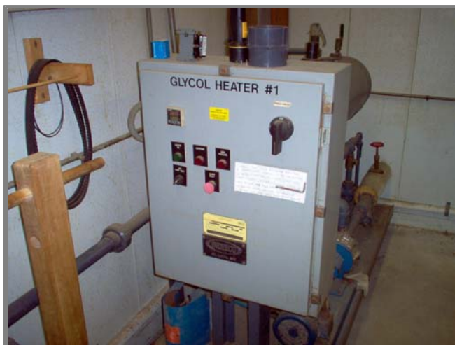
Photo left. Inside the treatment plant.