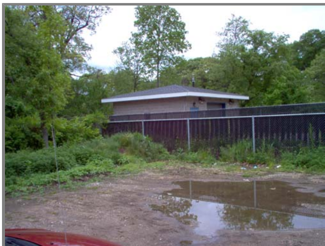
Photo left. another view of Franklin Cleaners' plant.

Photo left. Franklin Cleaners' treatment plant is located about a mile from the actual cleaners business location. The plant is between the Southern State Parkway and Molloy College. Franklin Cleaners' plant is "a first class operation all the way," having been designed with input from the old BHSC O&M Section.