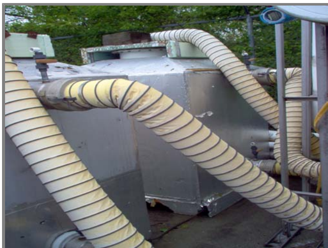
Photo left. Influent lines leading to the carbon vessels.