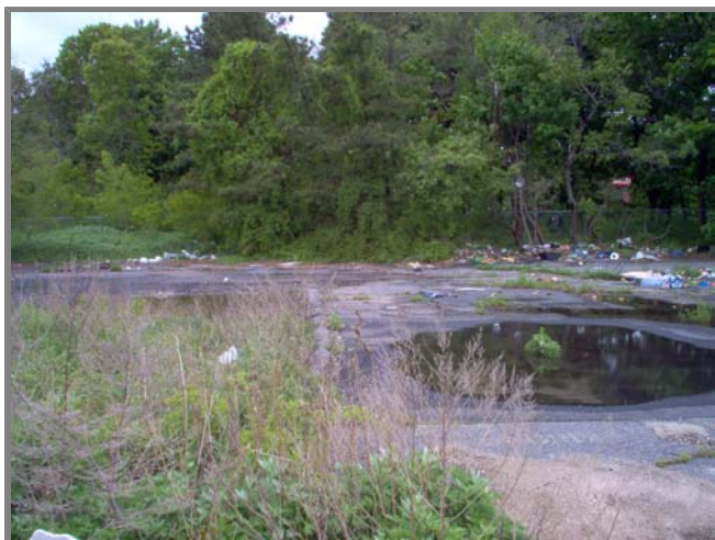
Photo left. Liberty Industrial site.