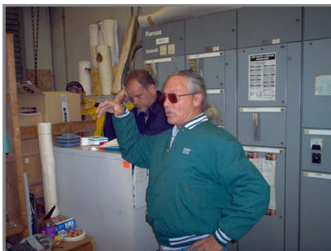
Photo left. Inside the treatment plant.