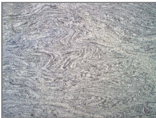
Photo left. On of numerous dimension stone slab, near monitoring wells.