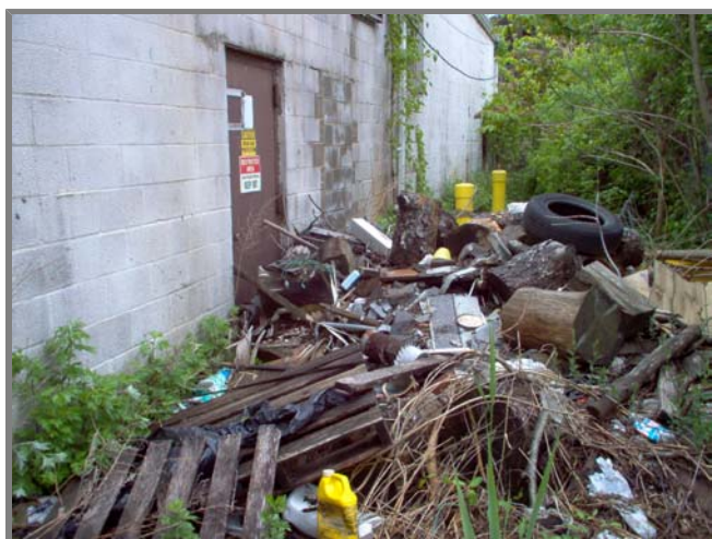
Photo left. NYSDEC-owned plant at Site No. 152077, ServAll Laundry, 8 Drayton Avenue, Bayshore, NY 11706. We wish to dismantle this plant. The first step in decommissioning would be garbage removal! We couldn't gain access on 5/26.