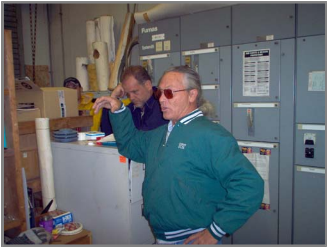
Photo left. Inside the treatment plant.