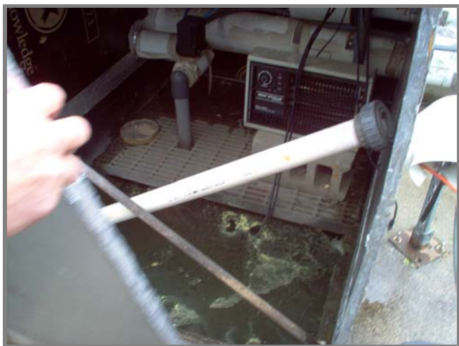
Photo left. Inside the treatment plant.