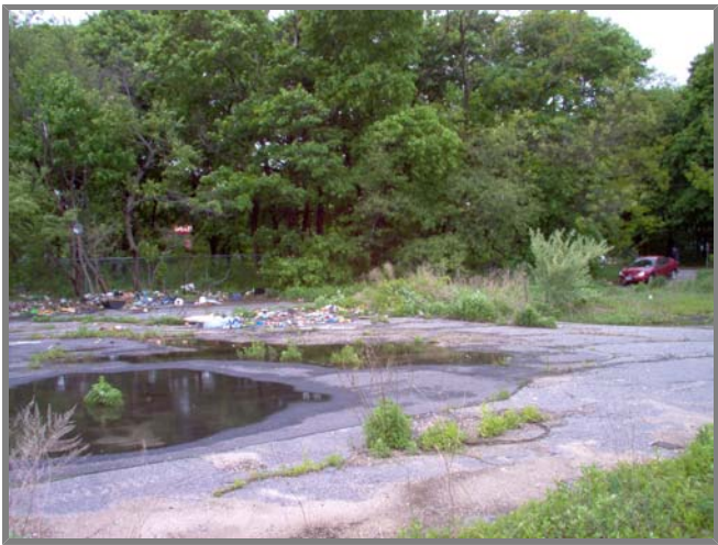
Photo left. Looking accross the pad towards the entrance way.