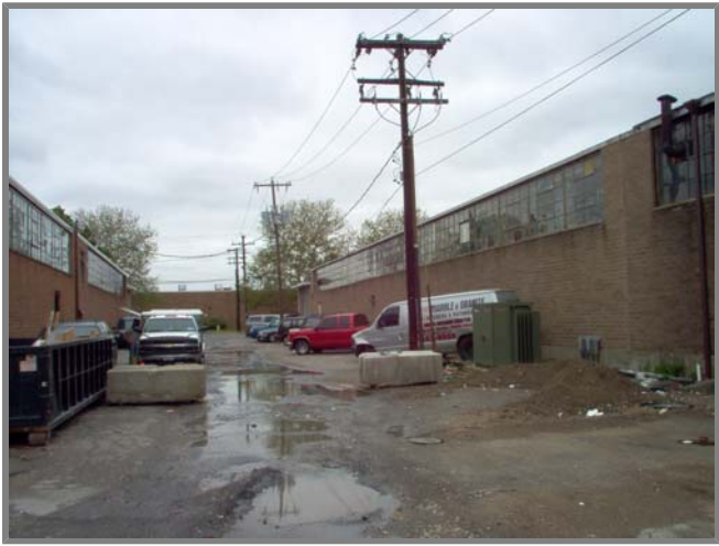
Photo left. SMS Yard