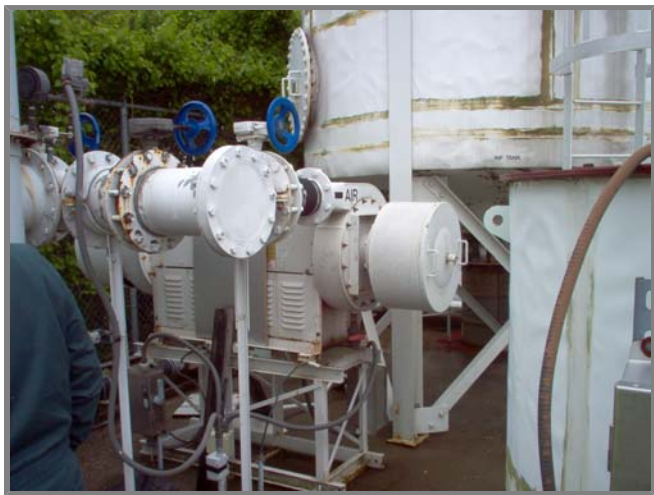
Photo left. Exterior piping.