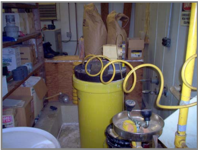
Photo left. Inside the treatment plant.