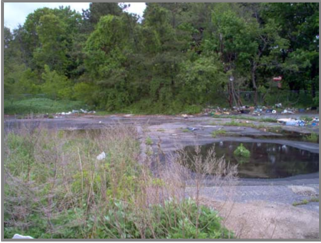
Photo left. Liberty Industrial site.