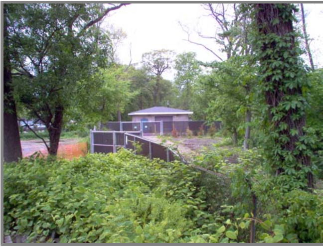
Photo left. Franklin Cleaners' treatment plant is located about a mile from the actual cleaners business location. The plant is between the Southern State Parkway and Molloy College. Franklin Cleaners' plant is "a first class operation all the way," having been designed with input from the old BHSC O&M Section.