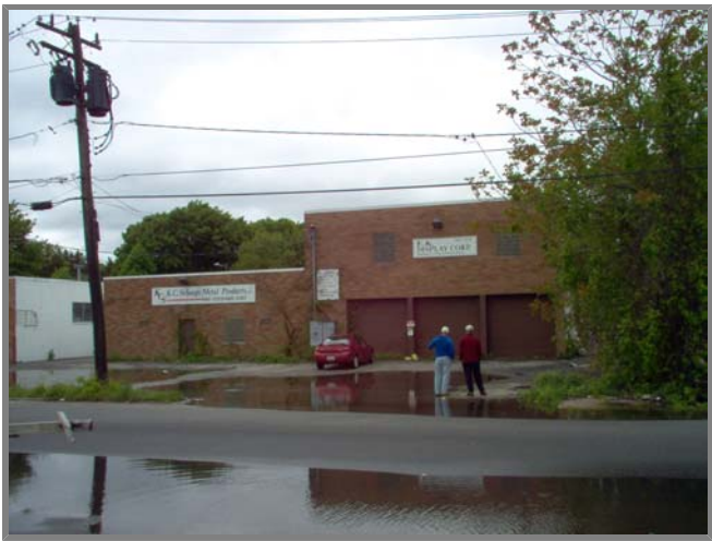
Photo left. View from accross the street.