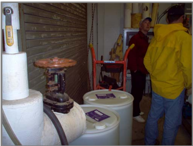
Photo left. Just inside the treatment plant.