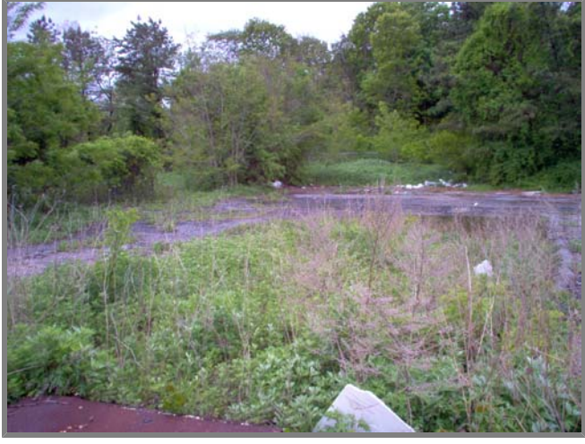
Photo left. Liberty Industrial site.