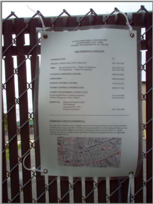
Photo left. Active Industrial Uniform

ACTIVE INDUSTRIAL UNIFORM SITE LEWISTOWN, NEW YORK UNIFORM SITE IDENTIFICATION No. 101-010 SEE EMERGENCY CONTACTS EMERGENCY: 911 STATE: Sullivan County Police Department (518) 736-3338 FIRE: Fire and Rescue Dept. - Village of Lewistown Fire Department - Village of Lewistown (518) 236-2112 (518) 891-3388 NATIONAL RESPONSE CENTER: (800) 424-9337 CHEMTREC: (800) 424-9338 POISON CONTROL CENTER: (716) 833-2323 HYDRO CONTROL INFORMATION: (800) 457-7162 NUCLEAR ENGINEERING CONSULTANT: Duke and Associates Consulting Engineers 25 West Enterprise Center (Paper) (716) 566-6800 (716) 443-8476 DELETED: Removals Division (Lewistown) 300 Broadway Lewistown, NY 13350 Central Lewistown (518) 899-5949 EMERGENCY ROUTE TO INDUSTRIAL Start at State Thruway (Route 28) and travel east to Exit 10 (Lebanon) and follow to Westfield Center. Turn left at Westfield Center and follow to West Newark Highway. Turn right onto Newark Highway and follow to Westfield Center. Turn left and follow to Lehigh. Turn right on Lehigh Avenue and follow to Westfield Center. (Please refer to right hand side of map for details.)