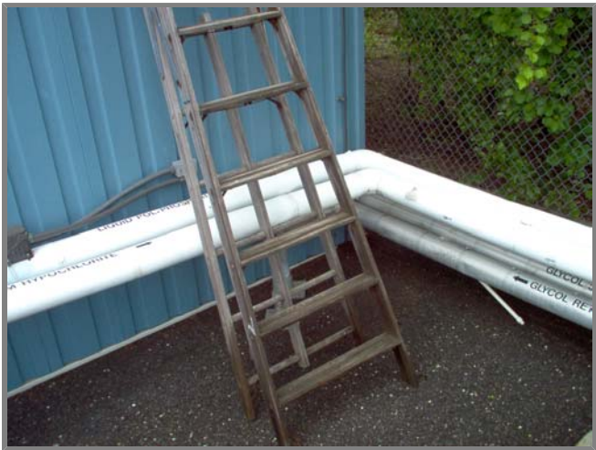
Photo left. Exterior piping.