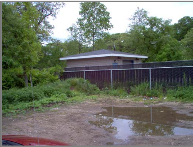
Photo left. another view of Franklin Cleaners' plant.

Photo left. Franklin Cleaners' treatment plant is located about a mile from the actual cleaners business location. The plant is between the Southern State Parkway and Molloy College. Franklin Cleaners' plant is "a first class operation all the way," having been designed with input from the old BHSC O&M Section.