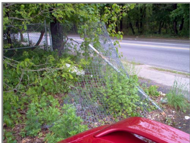
Photo left. Liberty Industrial site, broken gate.