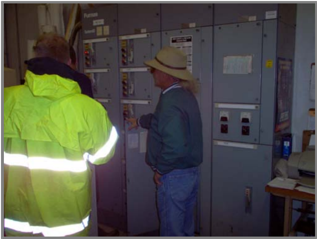
Photo left. Inside the treatment plant.