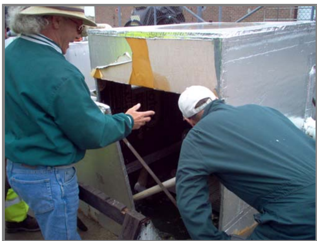
Photo left. Inside the treatment plant.