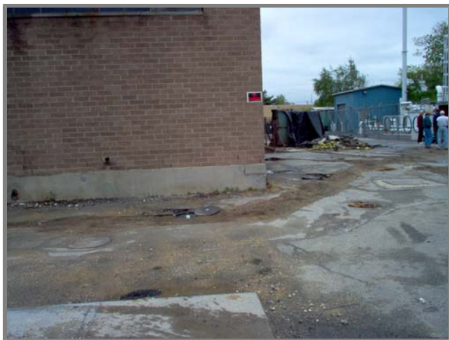
Photo left. SMS Yard