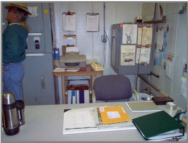
Photo left. Inside the treatment plant.