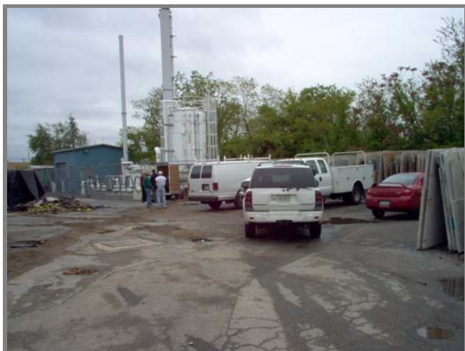
Photo left. SMS Yard