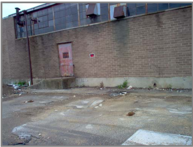
Photo left. SMS Yard