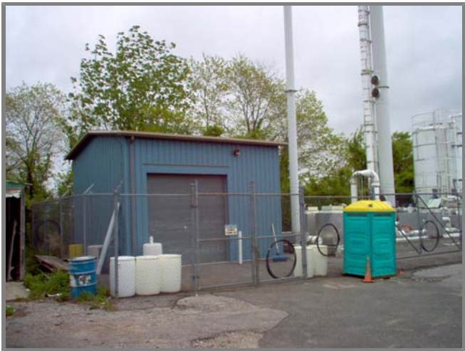
Photo left. Treatment building