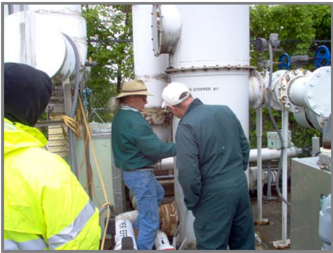
Photo left. Getting the tour.