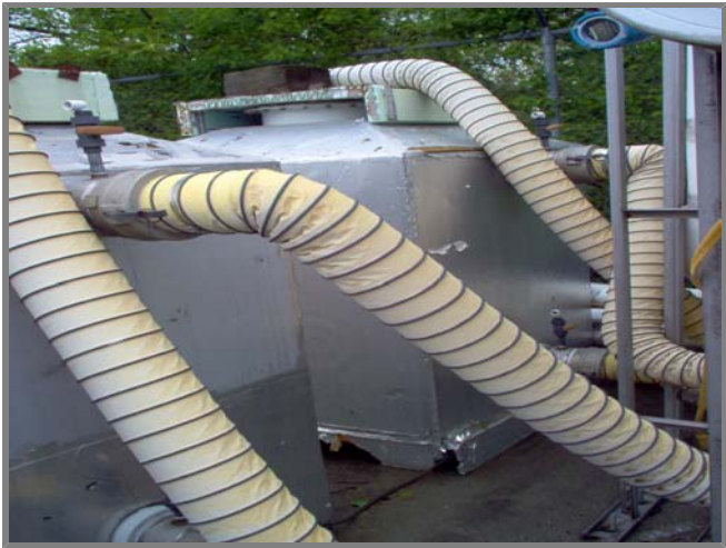
Photo left. Influent lines leading to the carbon vessels.