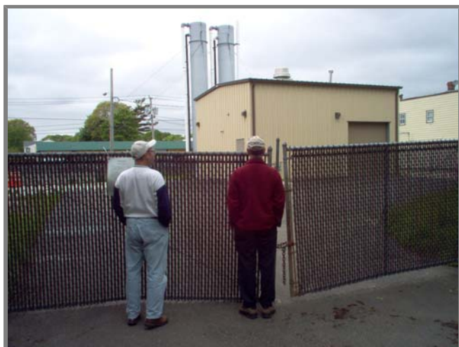
Photo left. Site 152125, Active Industrial Uniform.