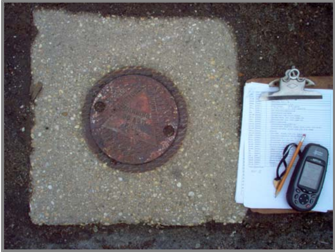
Photo left. Site monitoring well.