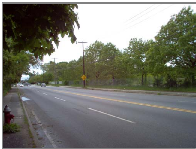
Photo left. Liberty Industrial site.