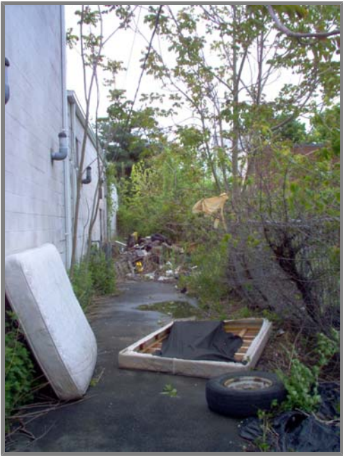
Photo left. Alley alongside of the door. More trash.