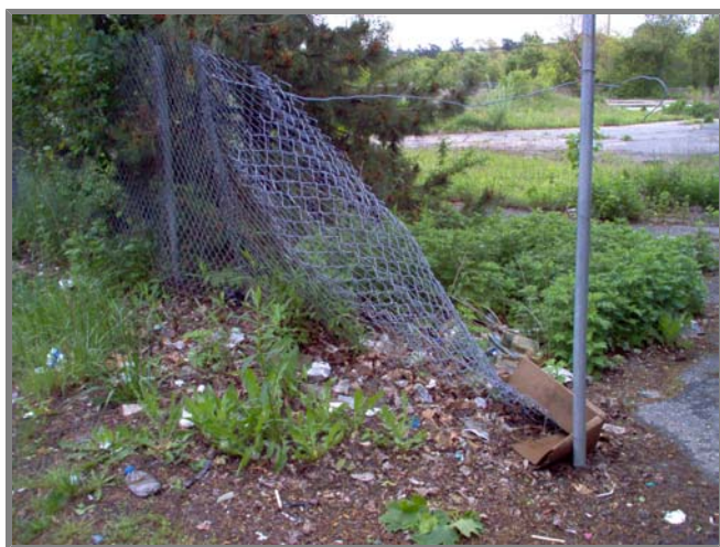
Photo left. Liberty Industrial site, broken gate.