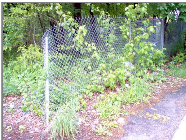
Photo left. Liberty Industrial site, broken gate.