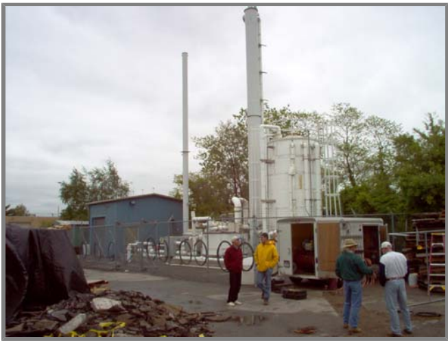
Photo left. The remedial system in the background. SMS owns the white towers and piping plus the treatment plant building. EarthTec, an EPA contractor, owns the yellow trailer.