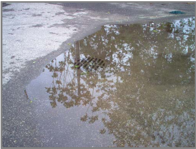
Photo left. Plugged drain in front of the plant.