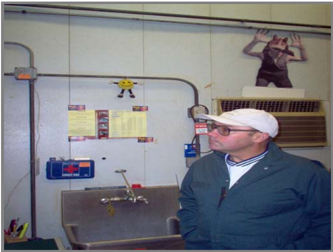
Photo left. Inside the treatment plant.