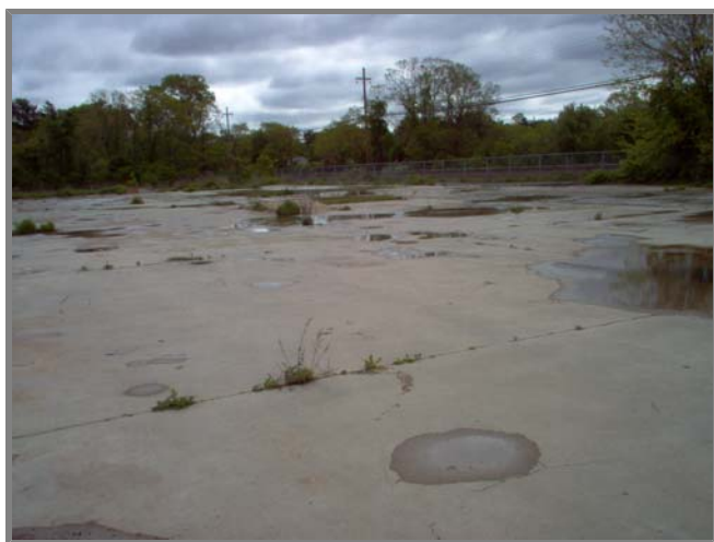
Photo left. Liberty Industrial site.