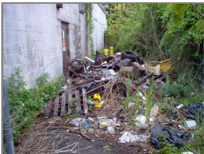
Photo left. ServAll's locked side doorway.