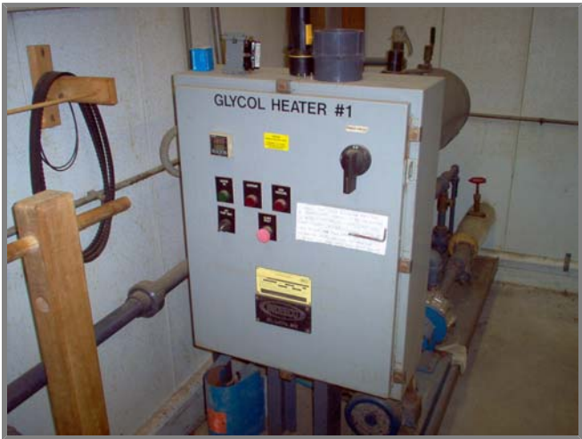
Photo left. Inside the treatment plant.