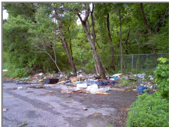
Photo left. Trash inside the open fence along the driveway.