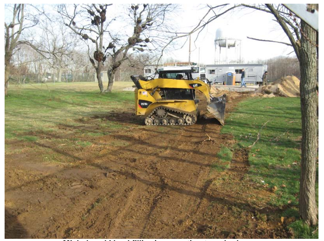
Michalowski backfilling/compacting trenched area.