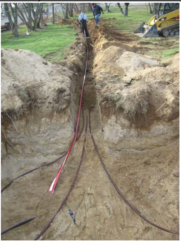
Gray Electric installing supply lines and caution tape.