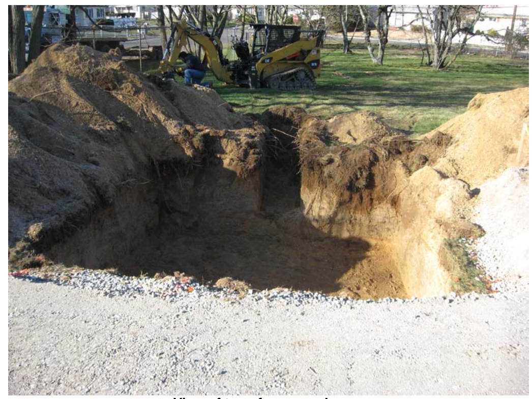
View of transformer pad area.