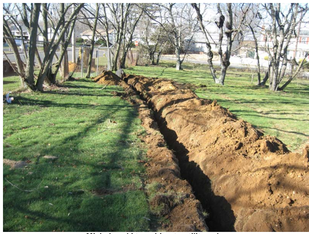
Michalowski trenching to utility pole.