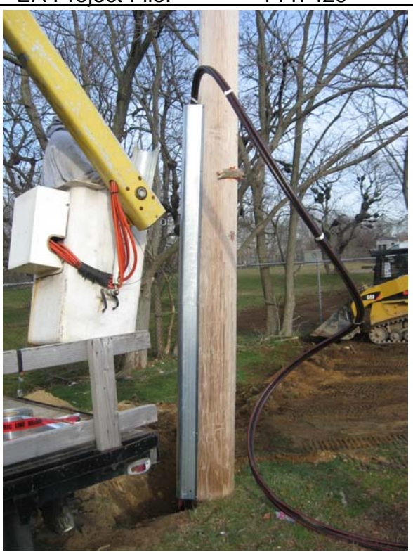
Gray Electric attaching supply lines to utility pole.