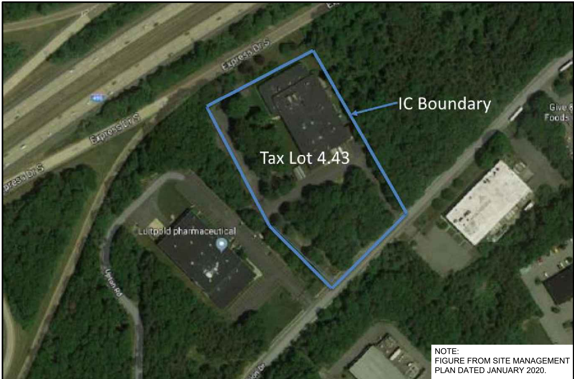
AMERICAN REGENT SITE MANAGEMENT PLAN

F:\5578\5578-03B\dwg\5578-C-FIG 4.dwg, Layout1, 11/23/2022 8:37:58 AM, rferrell