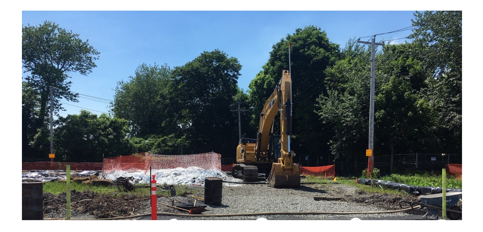
Photo 3: Pilot test area at end of work day. Excavation area is fenced and covered with foam to prevent odors.