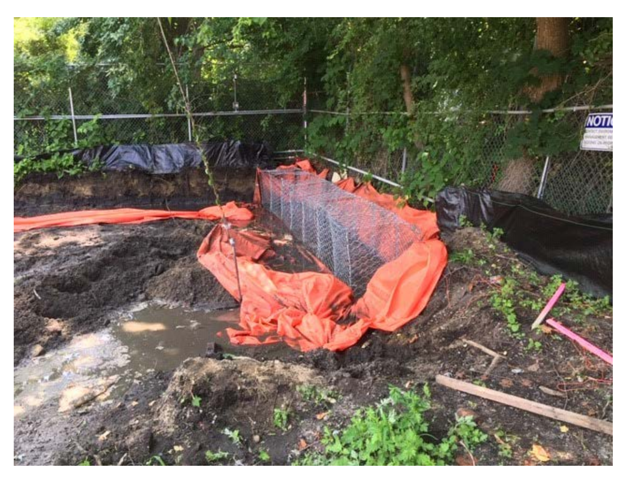
Photo 1: Gabion baskets at southwest corner of two-foot excavation area.