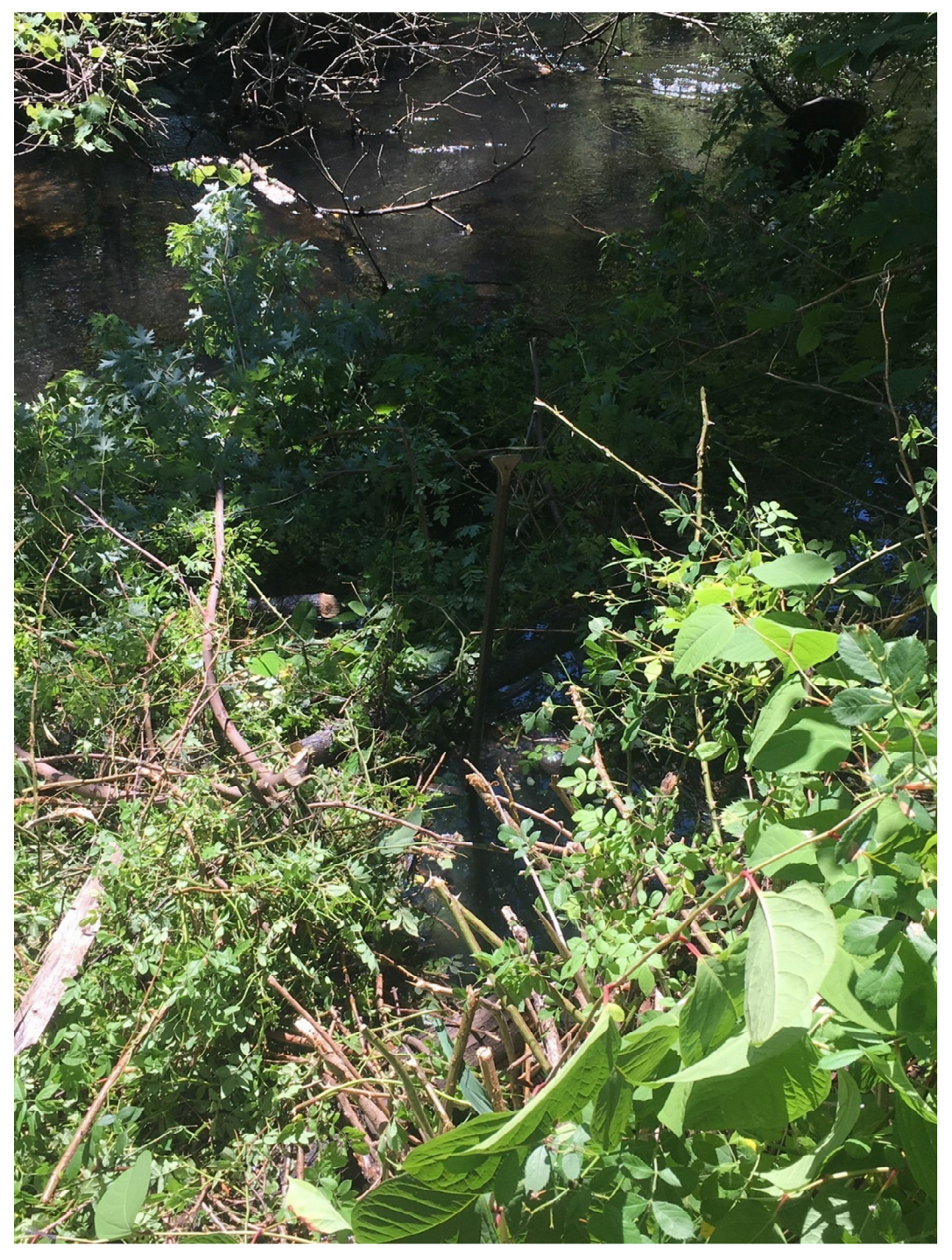
Photo 2: Outfall location on Patchogue River marked with metal pole.