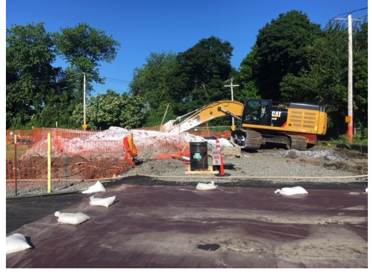
Photo 2: Mixing in Cell A13 after application of foam to reduce odors.