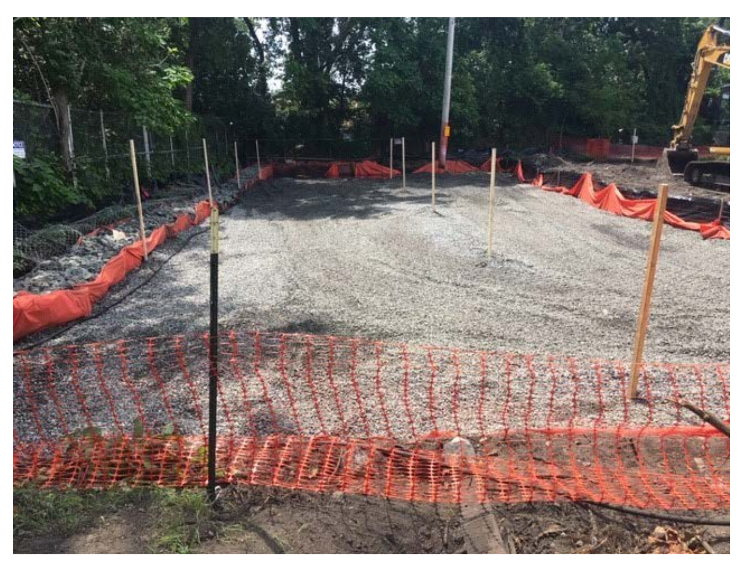
Photo 1: Two-foot excavation area at the end of the day on 7/17/19.