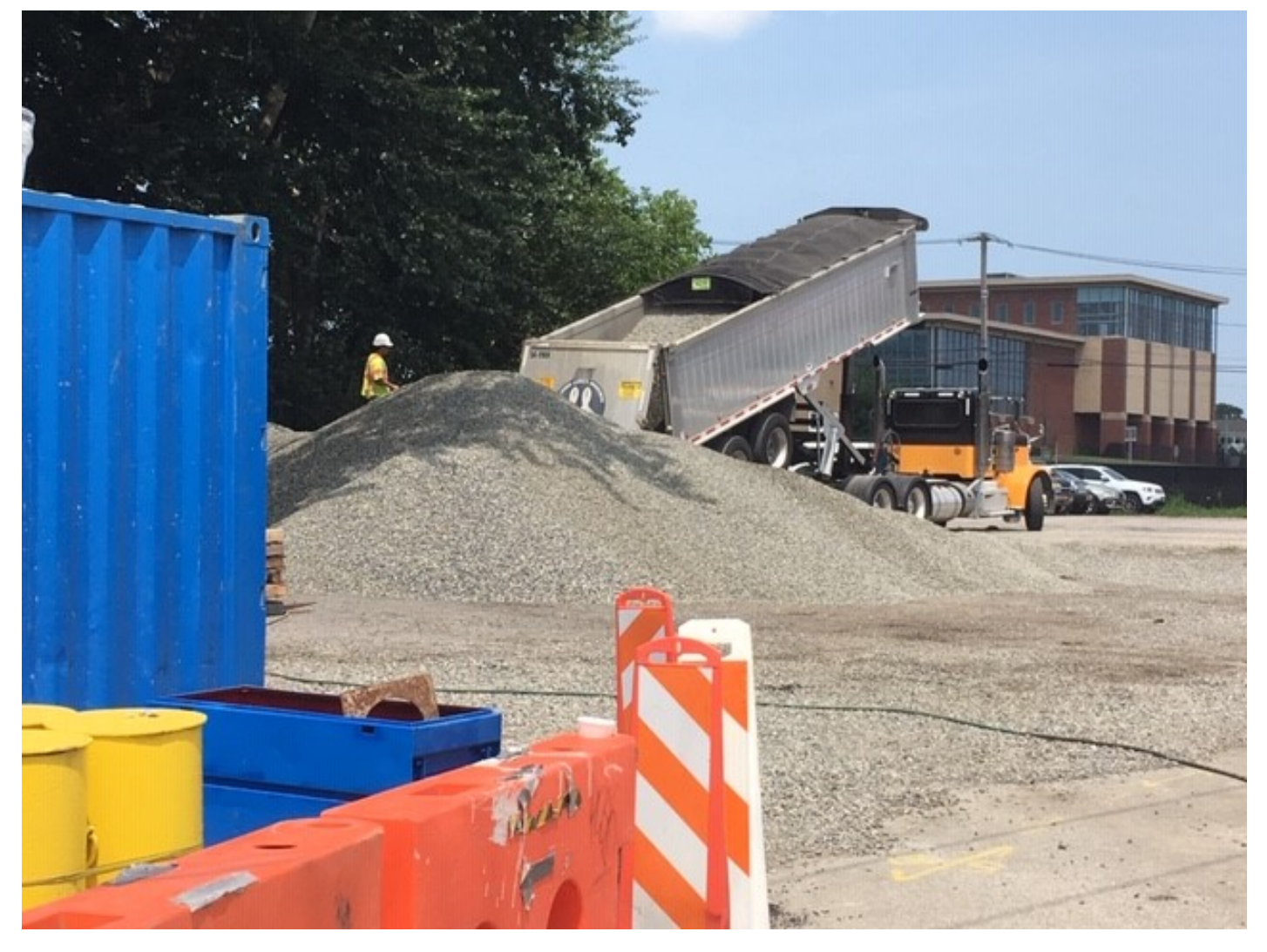
Photo 2: Crushed stone delivery. Posillico sprayed stone with water during delivery to mitigate dust.