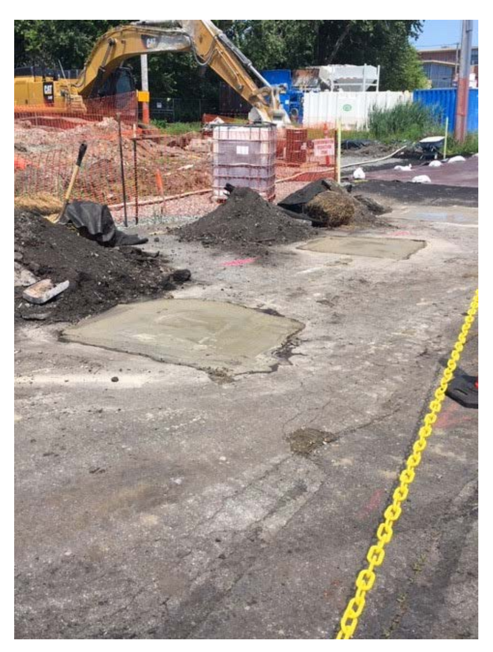
Photo 1: Three of the areas excavated to plug pipe between northern and southern catch basins, filled in with cement.