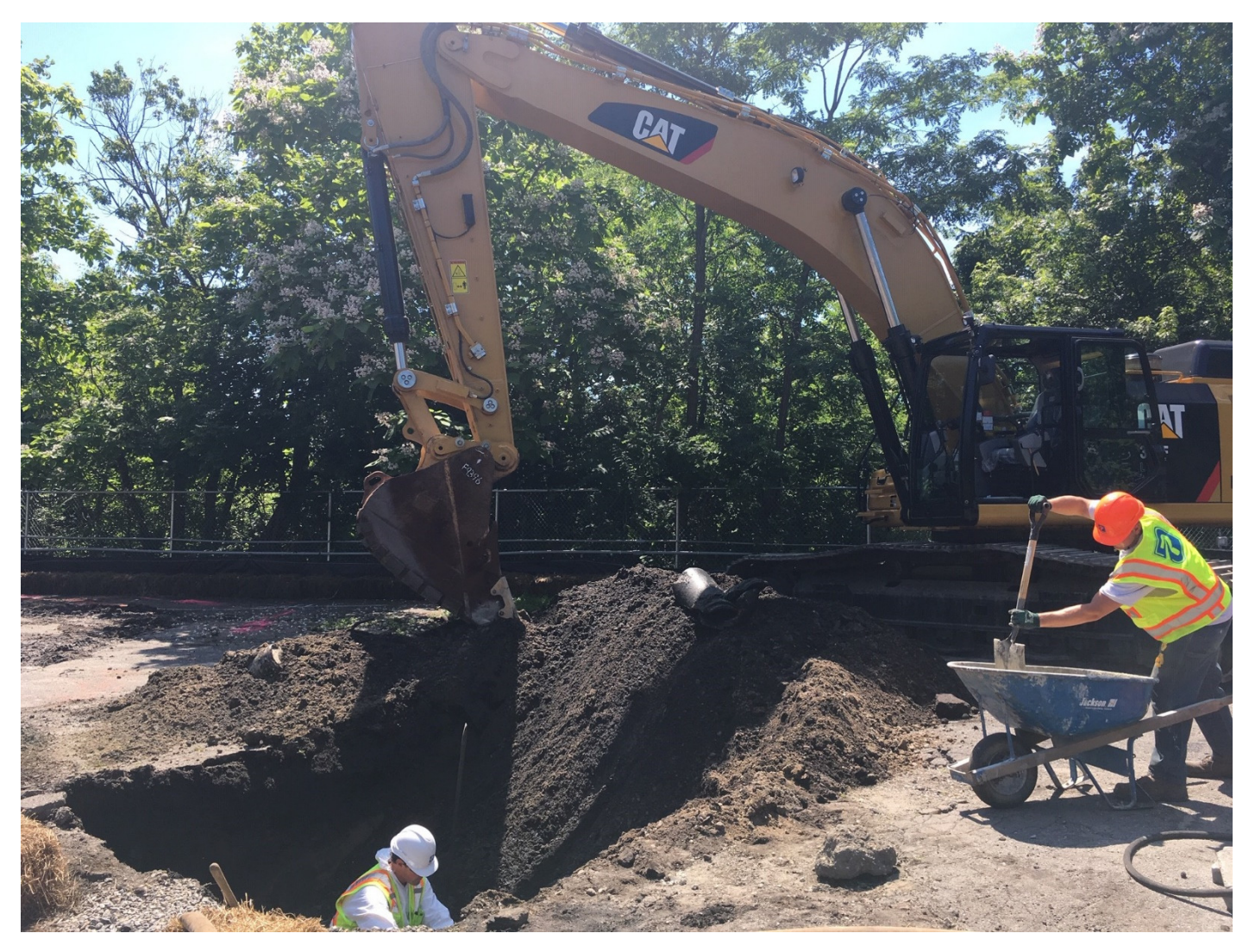
Photo 1: Plugging clay pipe outflowing from southern catch basin (located at the bottom left corner of the picture).