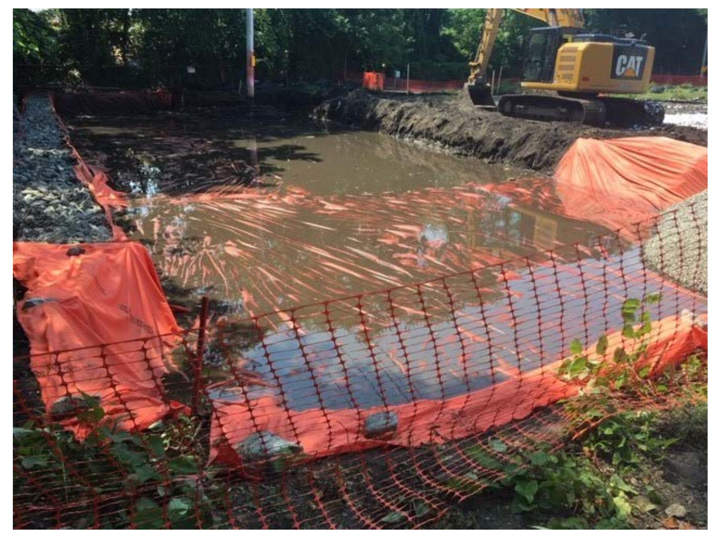
Photo 2: Two-foot excavation area at the end of the day on 7/16/19.