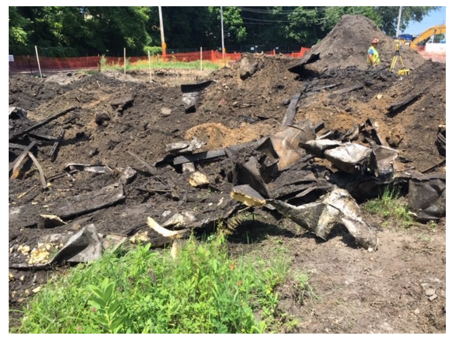
Photo 3: Excavated debris consisting primarily of scrap metal, foam, and wood.