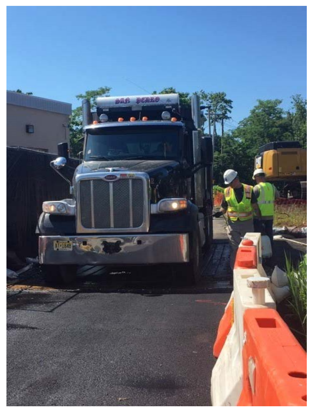
Photo 1: Truck being decontaminated after being filled with excavated soil.