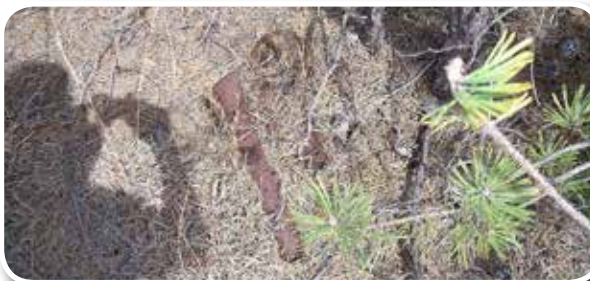
Practice rocket debris at the former Suffolk County Army Air Field Range Complex

Because explosive hazards associated with military munitions from past military training may remain on the Bombing & Gunnery Range Complex, the U.S. Army Corps of Engineers recommends that landowners and visitors follow the 3Rs of Explosives Safety – Recognize, Retreat and Report.