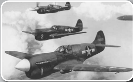
An aircraft that dropped practice bombs at the former Suffolk County Army Air Field Range Complex was the P-40 Warhawk