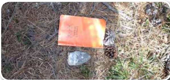
Practice rocket debris at the former Suffolk County Air Force Base

Because explosive hazards associated with military munitions from past military training may remain on the Airfield Dump and the Demolition Range, the U.S. Army Corps of Engineers recommends that landowners and visitors follow the 3Rs of Explosives Safety – Recognize, Retreat and Report.