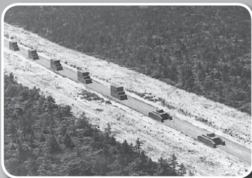
Aerial view of decoy tanks and trucks on road near runways at the former Suffolk County Air Force Base