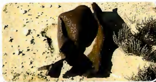
General purpose bomb debris at the former Suffolk County Air Force Base

Because explosive hazards associated with military munitions from past military activities may remain at the Airfield Dump, the U.S. Army Corps of Engineers recommends that the landowner and visitors follow the 3Rs of Explosives Safety – Recognize, Retreat and Report.