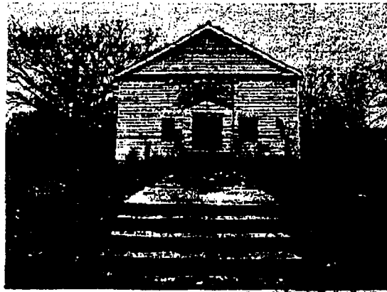
The state is moving to make 415 acres of land available to the public at Camp Hero, which has such unused buildings as a church, above, and a radar tower.