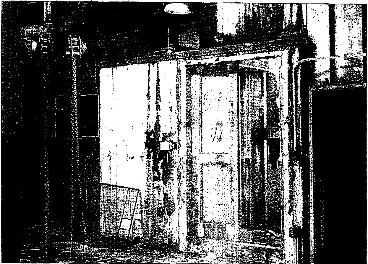
THE MANY BUNKERS and other abandoned structures at Camp Hero in Montauk will be surveyed to uncover any unexploded munitions.