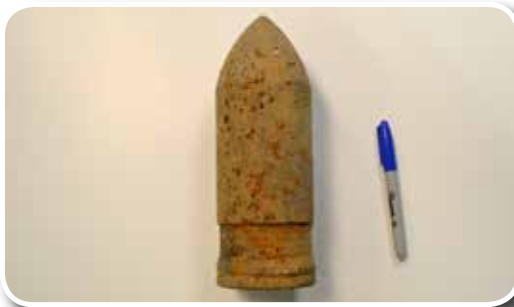
Example of a large caliber munition

Because explosive hazards associated with military munitions from past military training may remain on the Range Complex #1, the U.S. Army Corps of Engineers recommends that landowners and visitors follow the 3Rs of Explosives Safety – Recognize, Retreat and Report.