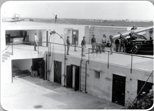
The former Fort Horatio Gouverneur Wright, Battery Dutton, early 1900s