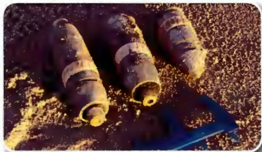
Example of medium caliber munitions

Because explosive hazards associated with military munitions from past military activities may remain on the land and in the waters of the Range Complex #1, the U.S. Army Corps of Engineers recommends that landowners, waterbody managers and visitors follow the 3Rs of Explosives Safety - Recognize, Retreat and Report.