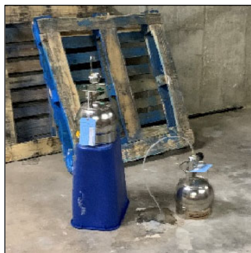
Indoor air sampling equipment

It's quick, it's free, and it will help keep you better informed. As a listserv member, you will periodically receive site-related information and announcements for all contaminated sites in the county(ies) you select.