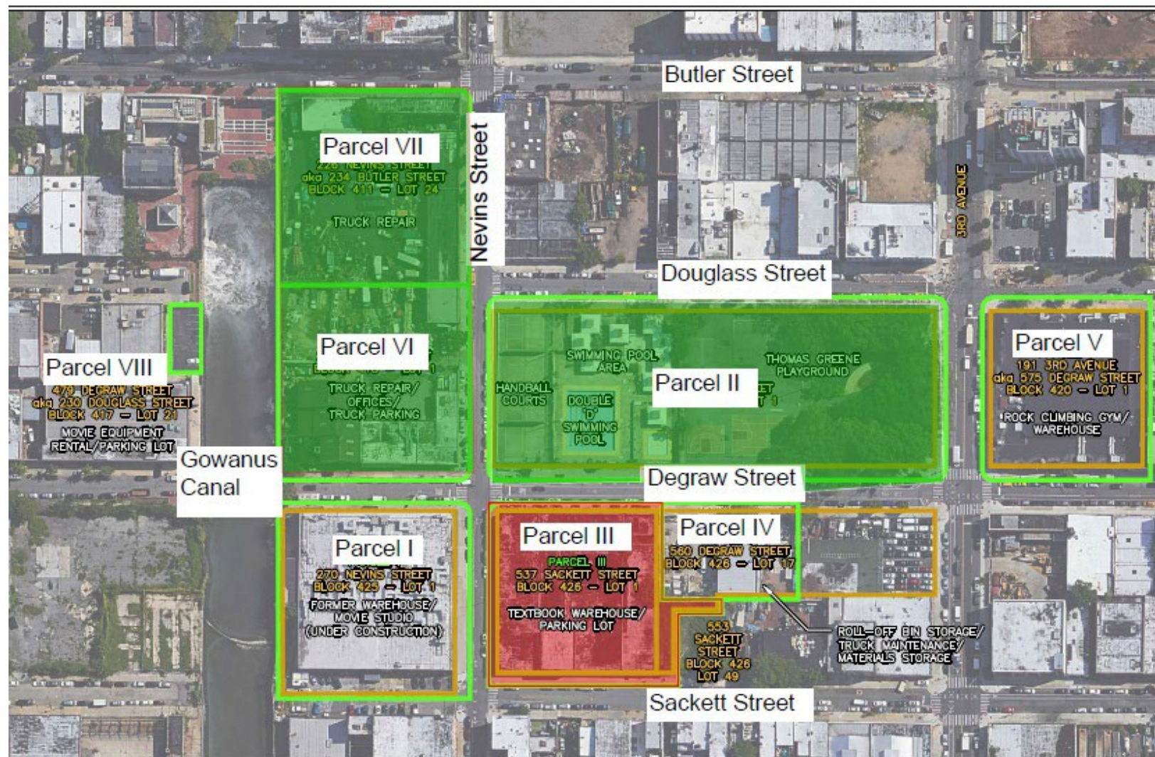
Site Location Figure Fulton Works Former MGP site (224051), Brooklyn, NY