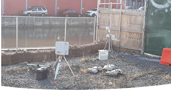
Community Air Monitoring Station.

Measures, such as those noted above, will be in place to minimize impact to the public. The site will also be secured with perimeter fencing to limit unauthorized access to work areas. The project website (URL below) will provide frequent updates and air monitoring data. Future community updates will be issued to keep residents informed. Those listed in the “box below can also be reached with projectquestions/concerns.