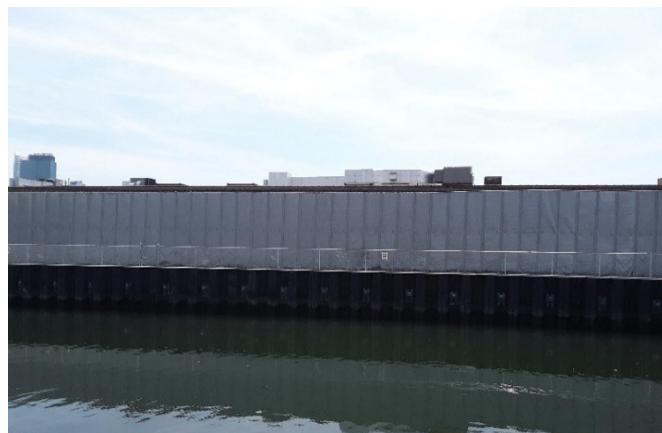
Completed Fulton MGP Sealed Bulkhead Barrier Wall Along Gowanus Canal.

NYSDEC oversaw the implementation of a PDI investigation on Parcel III of the Fulton Works MGP site from 2018 to 2021. NYSDEC recently approved a Remedial Action Work Plan (RAWP) for Parcel III and a portion of Parcel IV in March 2022, allowing cleanup activities to begin. The RAWP summarizes the remedy which is being implemented in accordance with the 2015 NYSDEC ROD. The cleanup activities will be performed by 545 Sackett LLC, the site owner, with oversight provided by the NYSDEC. Remedial activities are expected to begin late August, 2022, and last for approximately 12 months. Community Air Monitoring stations will be installed at the perimeter of the site and will operate 24/7 under NYSDEC oversight. In addition, a temporary structure will be erected to confine odors emanating from the excavation work. The air inside the structure will be filtered through activated carbon that absorbsthe odors before the air is discharged from the structure. A negative pressure is maintained in the temporary structure (air flow is inward) so odors do not escape when trucks/equipment exit the structure.