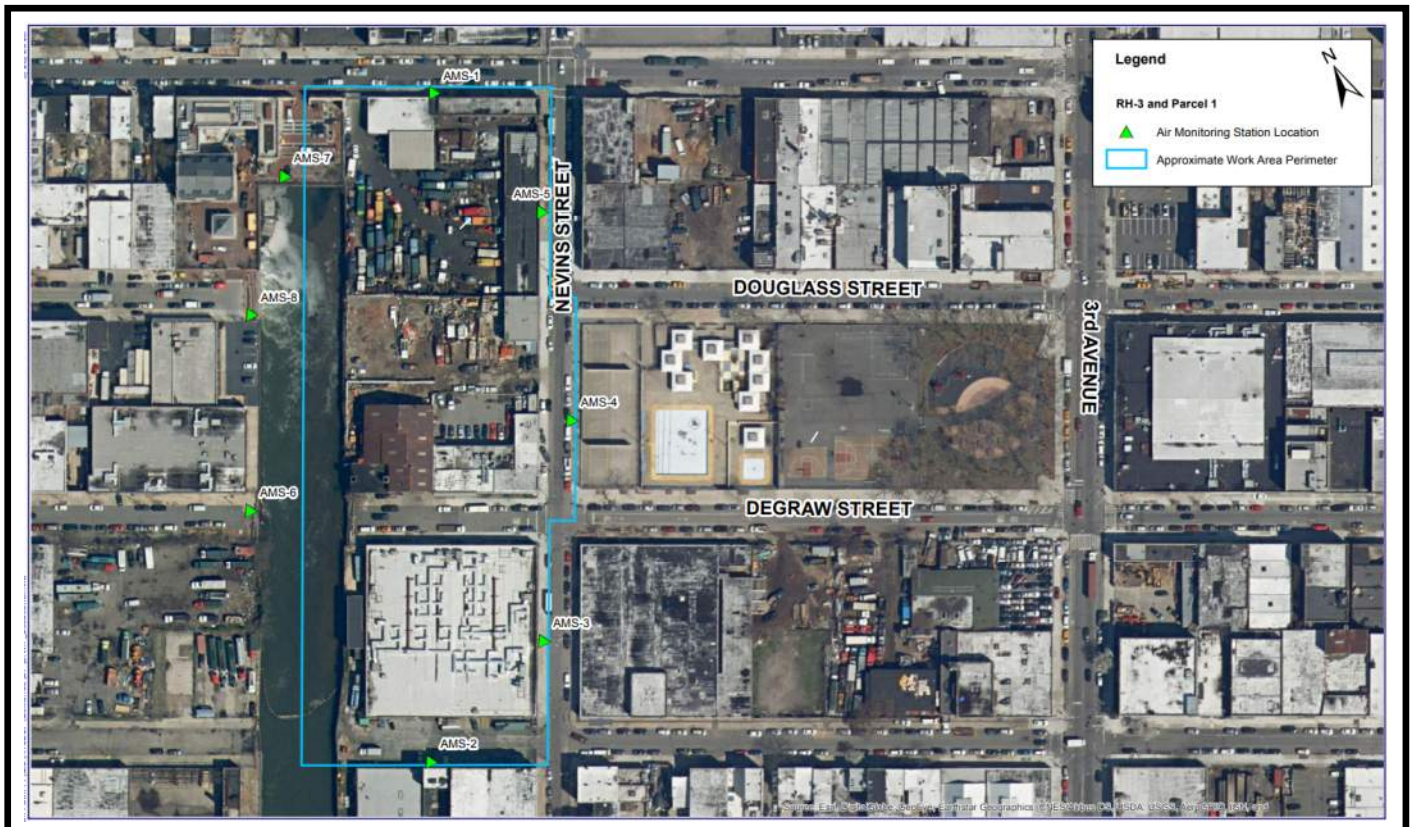
Figure 1 - CAMP Station Locations