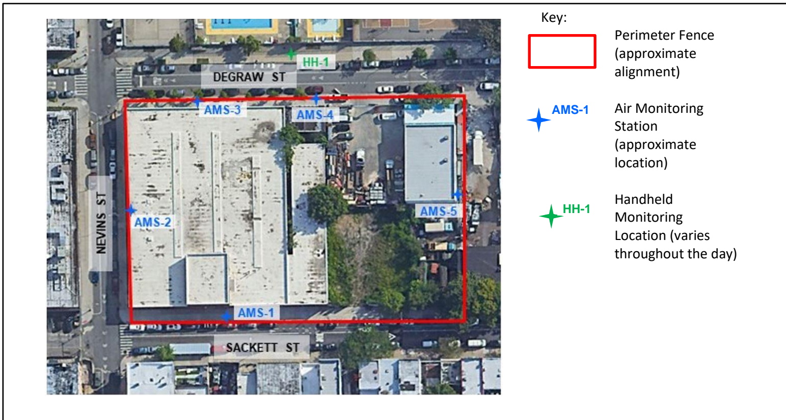
Figure 1 – CAMP Air Monitoring Station Locations

There were no TVOCs or PM 10 concentrations above the CAMP-established action levels, or observations of dust or odors associated with the Site during the monitoring period.