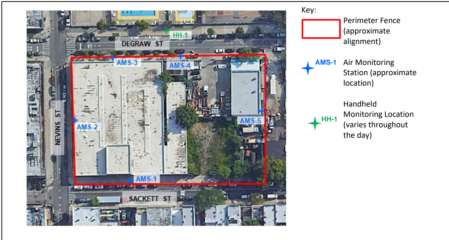
Figure 1 – CAMP Air Monitoring Station Locations

There were no TVOCs or PM 10 concentrations above the CAMP-established action levels, or observations of dust or odors associated with the Site during the monitoring period.