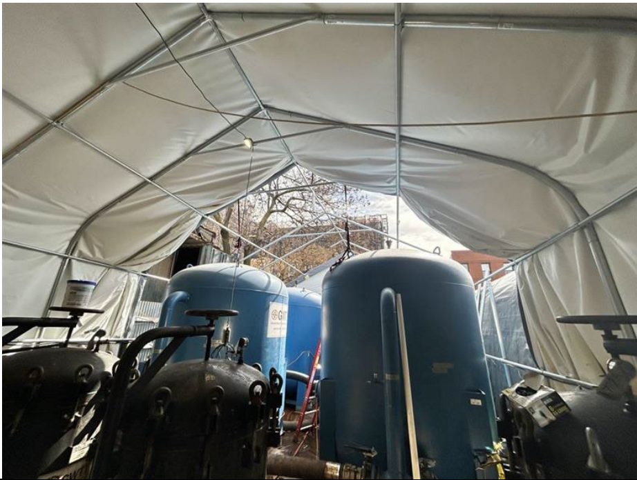
Photo 3: Looking east, view of CEI removing fabric enclosure around WTS in preparation of media change out.