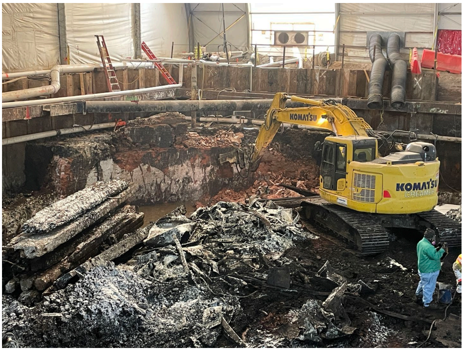
Photo 1: Looking northeast, view of CEI breaking the gas holder wall between WC-GHN and WC-9.