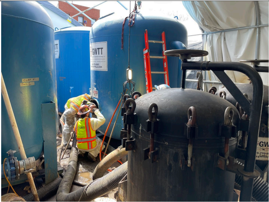
Photo 2: Looking northeast, view of CEI using vacuum truck to remove spent carbon from Train 2 of the water treatment system.