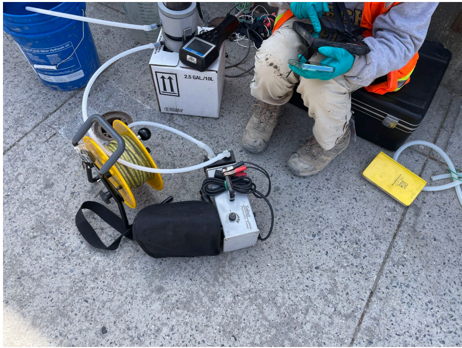
Photo 3: Looking east, view of Roux collecting groundwater from sentinel well SW-07S.