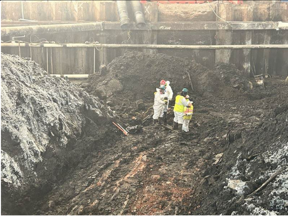
Photo 1: Looking east, view of ECS installing piezometer in Gas Holder 3.