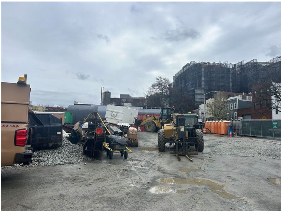
Photo 2: Looking east, view of CEI performing site maintenance and reorganization in preparation for WTS media change out next week.