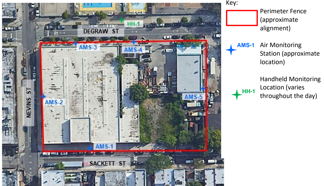
Figure 1 – CAMP Air Monitoring Station Locations

There were no TVOCs or PM 10 concentrations above the CAMP-established action levels, or observations of dust or odors associated with the Site during the monitoring period.