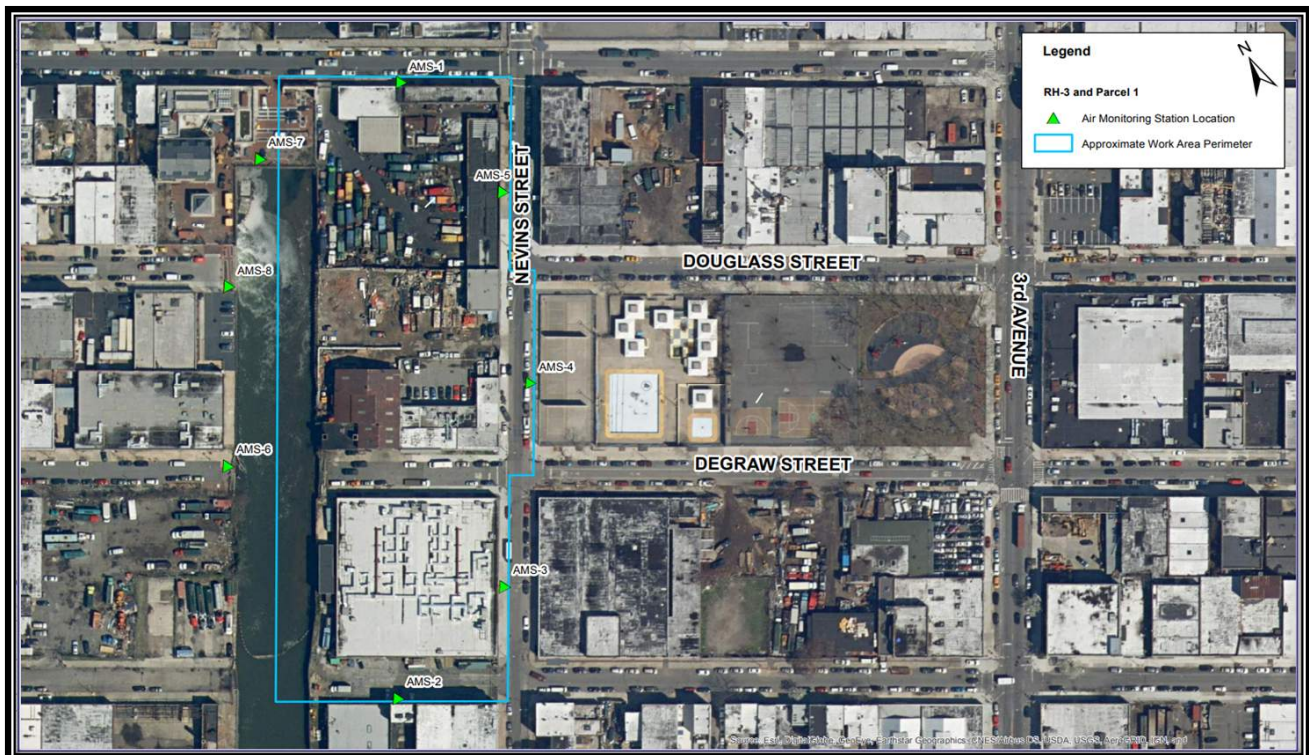
Figure 1 - CAMP Station Locations