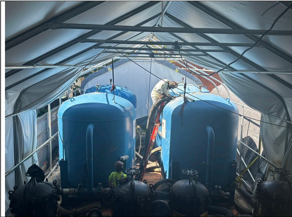
Photo 3: Looking south-southwest, view of CEI vacuuming spent filter media from the WTS with hosing to vacuum truck.